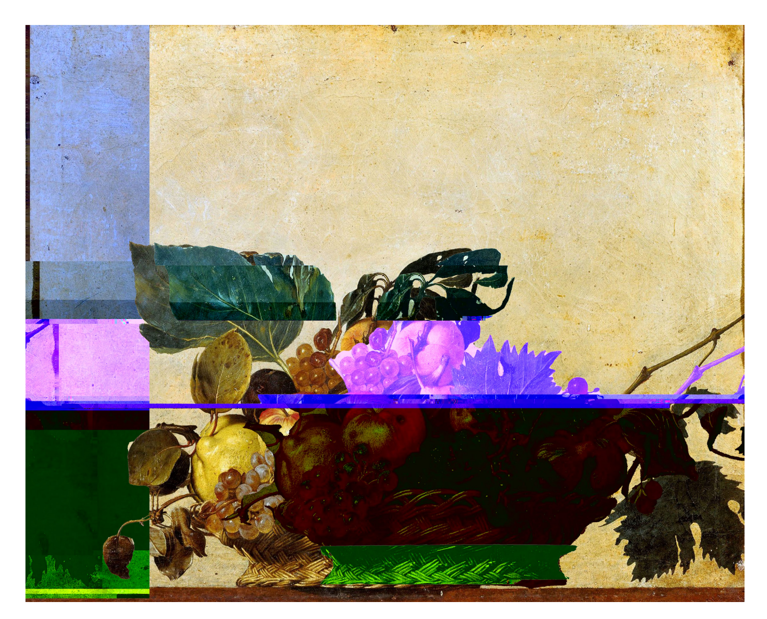
Basket of Rotten fruit, 2023, digital work