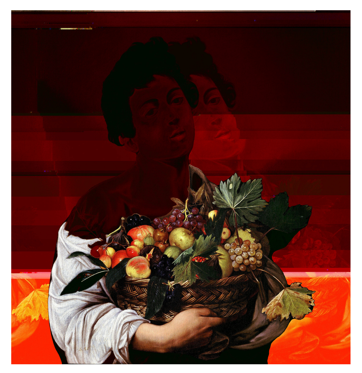
Boy with a Basket, Boy with a trouble heart , 2023, digital work