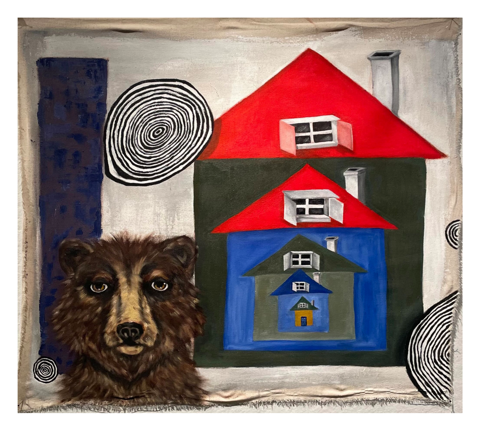
My Home , 2022, oil paint, 31" x 37"