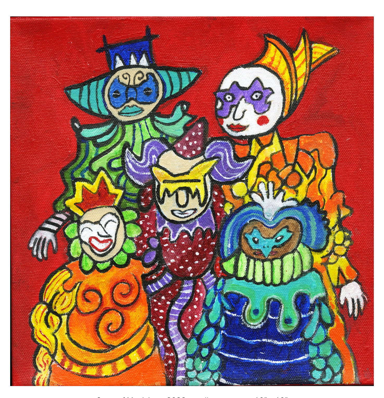
Court of Magicians, 2022, acrylic on canvas, 10" x 10" \,