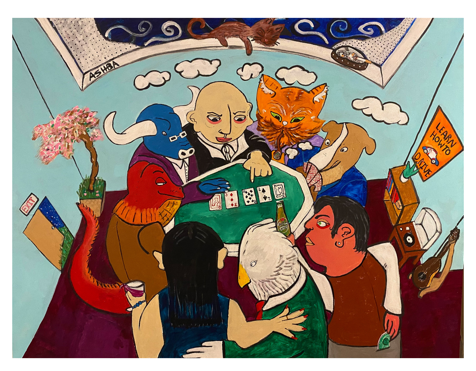
Old Friends by the Window, 2022, acrylic on canvas, 36" \times 48"