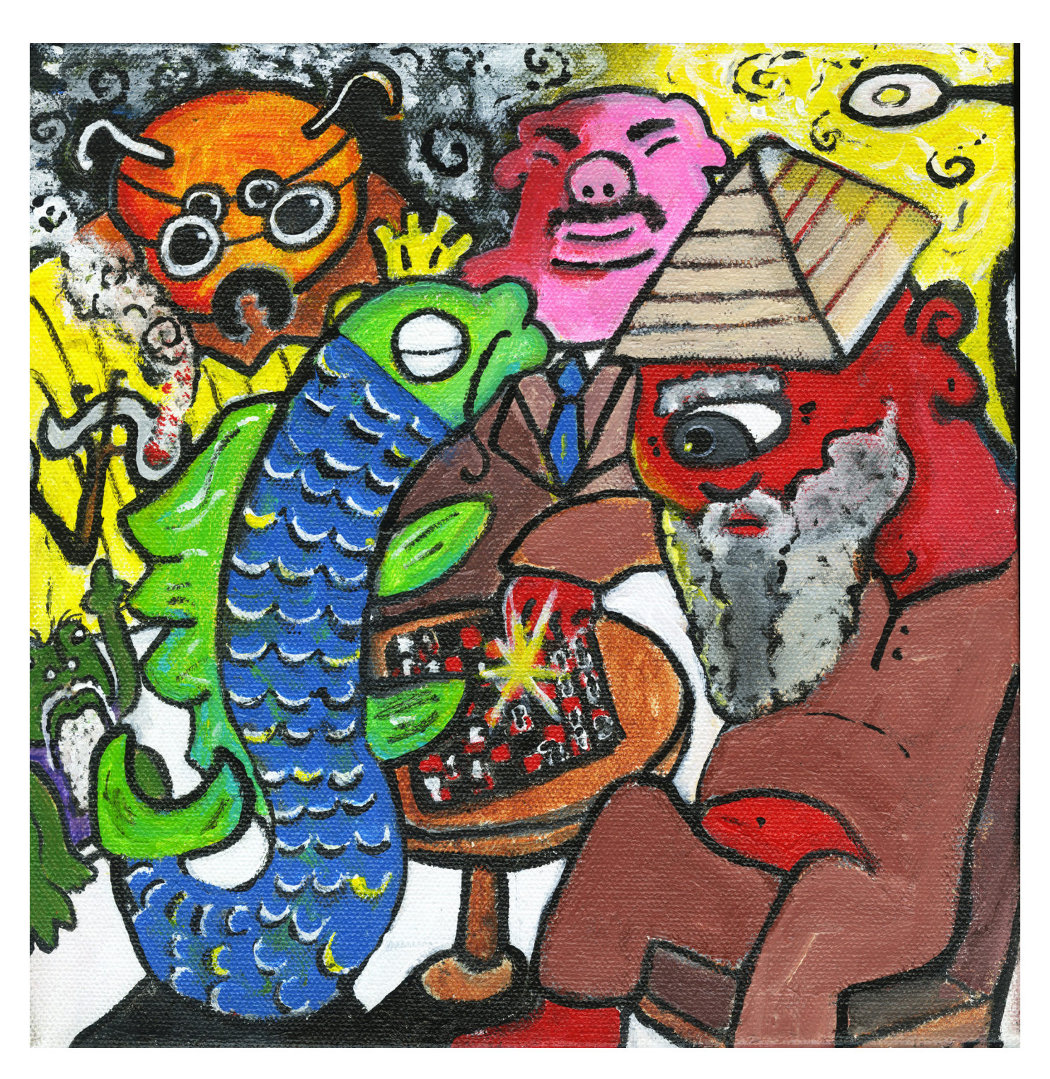
A Brief Gathering of Those that Avoid the Sun, 2022, acrylic on canvas, 10" x 10" \,