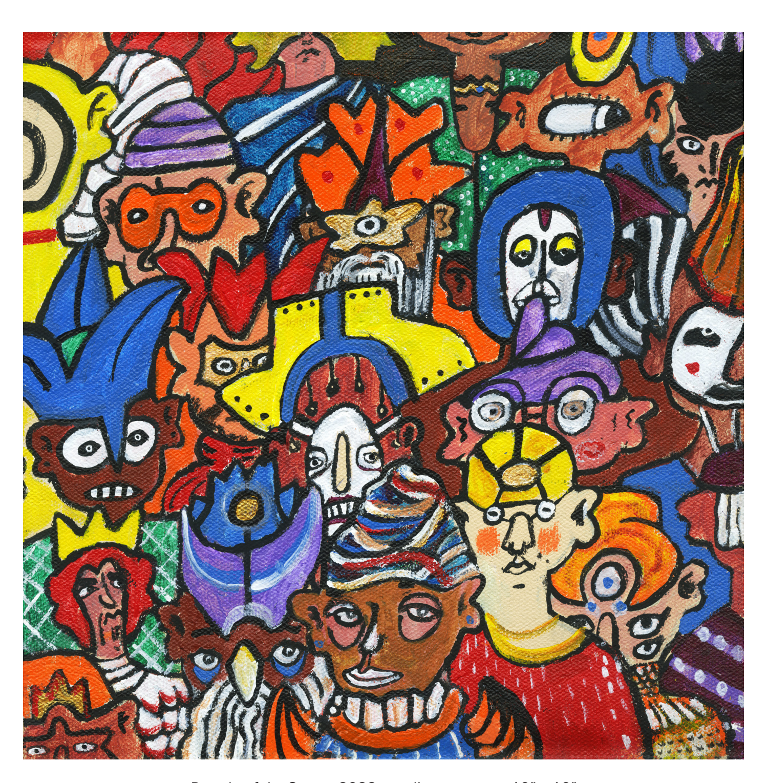
Parade of the Sages, 2022, acrylic on canvas, 10" x 10" \,