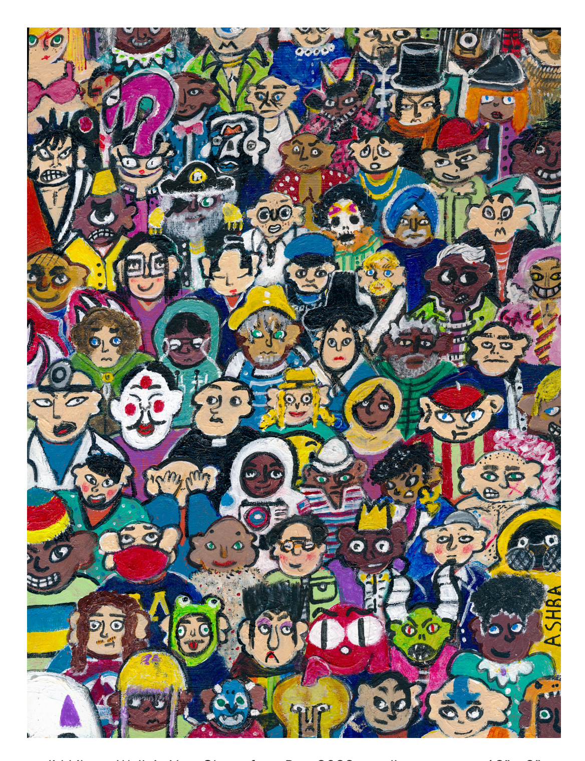
I'd Like to Walk in Your Shoes for a Day, 2022, acrylic on canvas, 12" x 9" \,