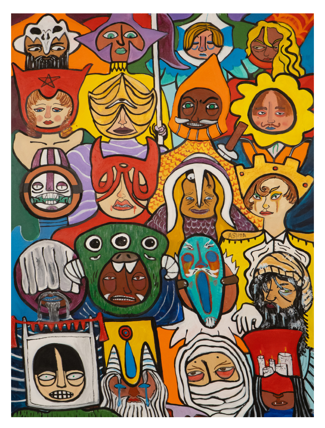
School of Unorthodox Scholars, 2022, acrylic on canvas, 48" \times 36"