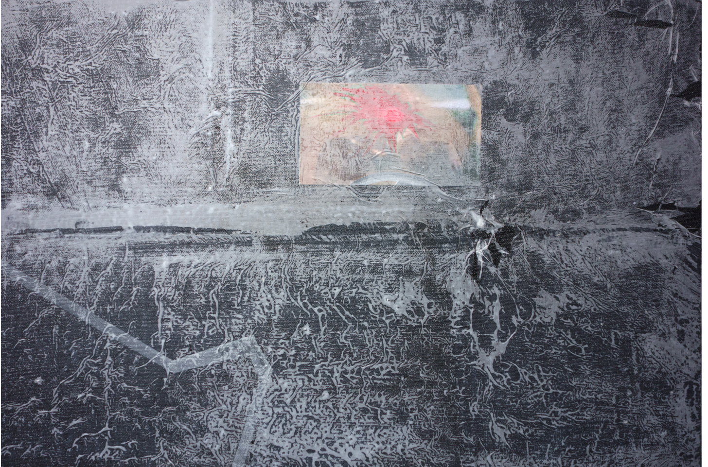
Frail Hero (Detail), 2022, acrylic and print on canvas, 31" x 26"