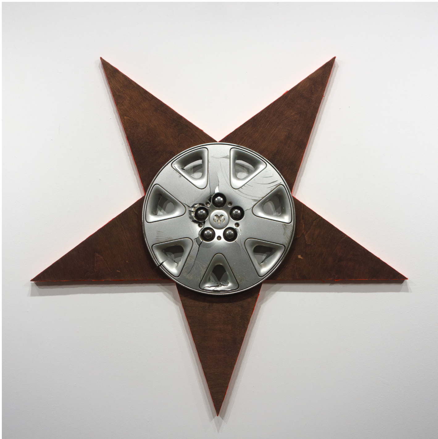
Dying Star , 2023, dodge ram hubcap, wood, cast acrylic, 41.5" x 41.5"