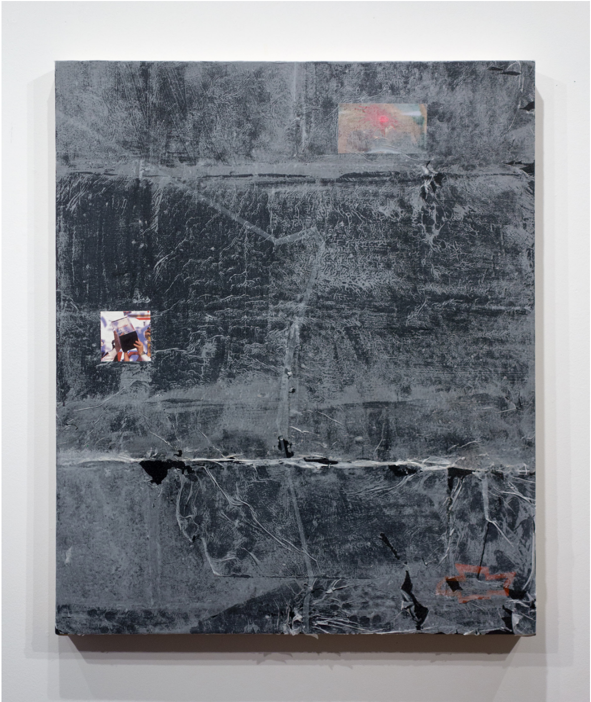
Frail Hero , 2022, acrylic and print on canvas, 31" x 26"