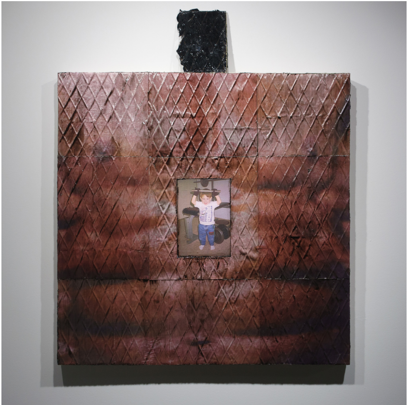
Untitled, 2022, acrylic, print, and photograph on canvas, with cast acrylic and plexiglass, 29.5" x 24"