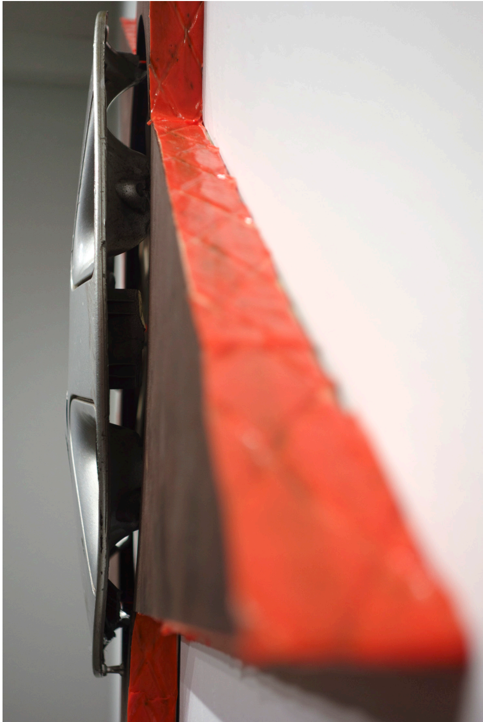
Dying Star (Detail), 2023, dodge ram hubcap, wood, cast acrylic, 41.5" x 41.5"