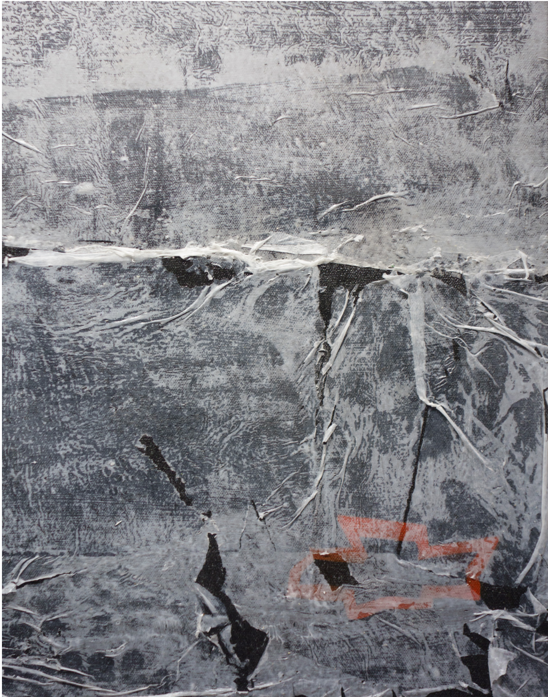
Frail Hero (Detail), 2022, acrylic and print on canvas, 31" x 26"