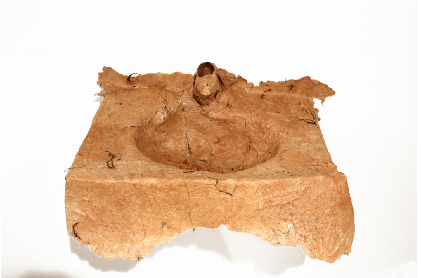
Fragile Morphologies of Pulp Bodies (Sink) , 2020, handbeaten kozo fiber and rattlesnake master leaf fiber, with inclusions of horsehair, soil, and mica. Cast from sink in Ingram's apartment.