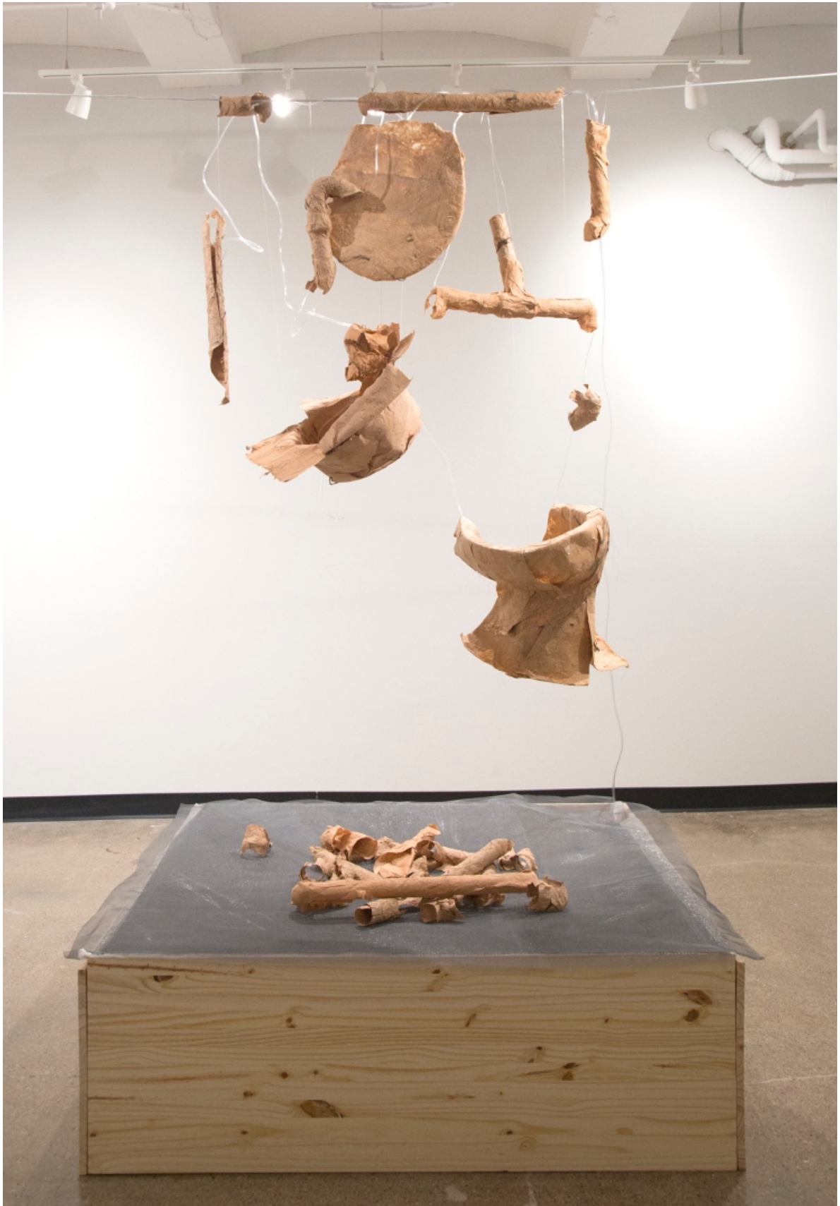
Fragile Morphologies of Pulp Bodies, 2019, test installation

Artist Note: In order to test the pumping system and general design, I set up a basic test with a handful of pipes, a sink, and a toilet, suspended above a small wooden basin that houses the pump and water tank. Materials included wood, assorted hardware, vinyl-coated steel cable, fishing line, airline tubing and plastic connectors, as well as handbeat kozo fiber and rattlesnake master leaf fiber, with inclusions of horsehair, soil, and mica.