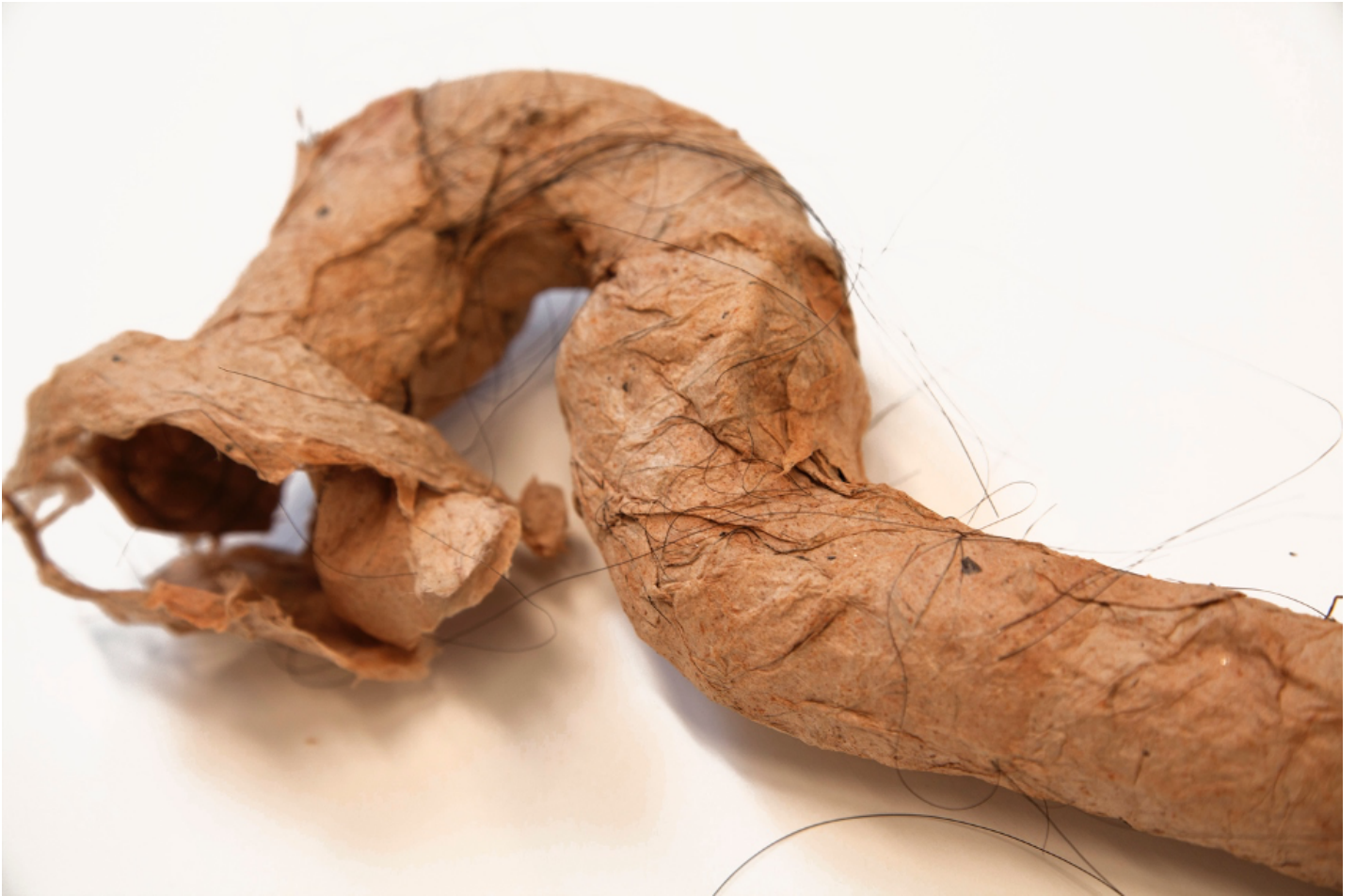
Fragile Morphologies of Pulp Bodies (Pipe Detail) , 2020, handbeaten kozo fiber and rattlesnake master leaf fiber, with inclusions of horsehair, soil, and mica. Cast from PVC pipes.