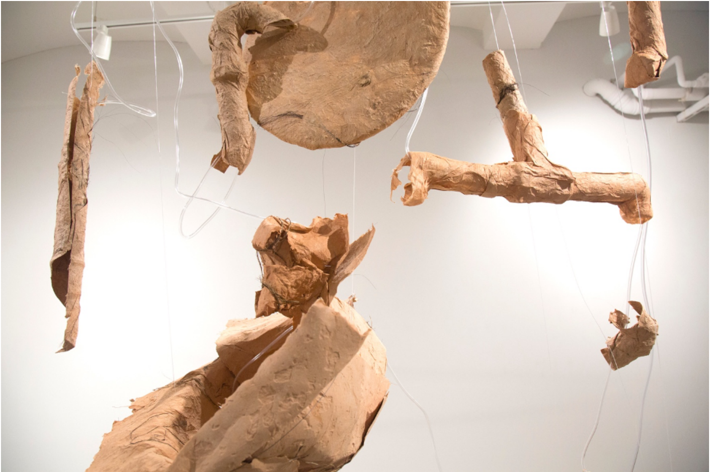
Fragile Morphologies of Pulp Bodies, 2019, detail of test installation, on day 1

Artist Note: Here you can see the sink and several pipes up close, along with the airline tubing and fishing line.