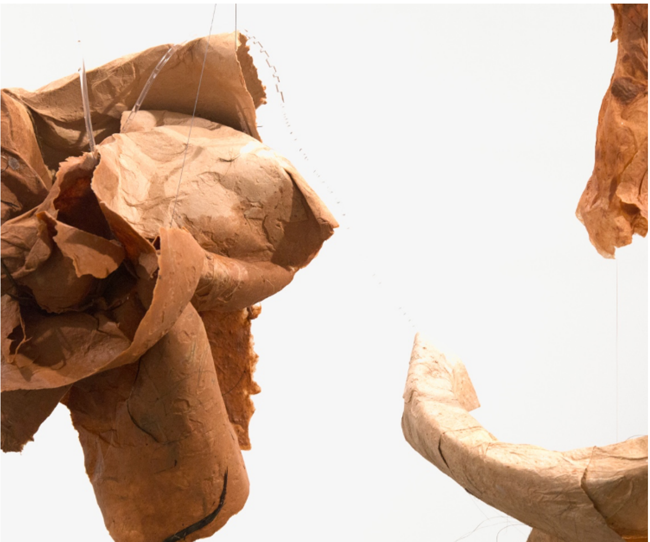
Fragile Morphologies of Pulp Bodies , 2019, detail of test installation on day 4