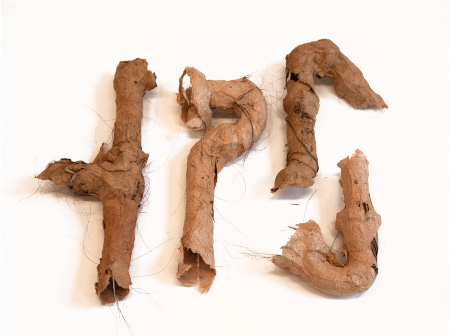
Fragile Morphologies of Pulp Bodies (Pipes) , 2020, handbeaten kozo fiber and rattlesnake master leaf fiber, with inclusions of horsehair, soil, and mica. Cast from PVC pipes.