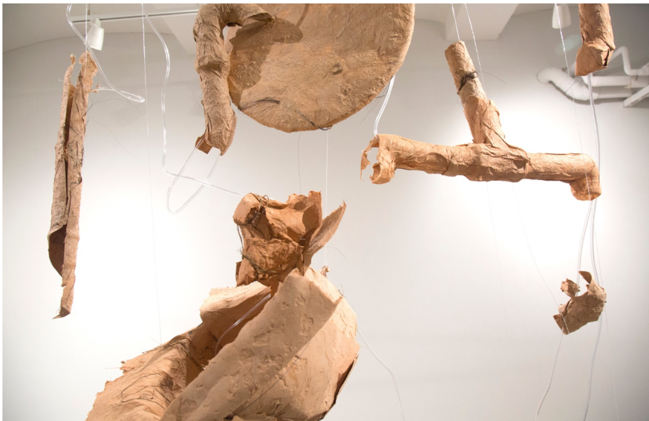
Fragile Morphologies of Pulp Bodies , 2019, detail of test installation, on day 1

The DEPS Artist Profile Series , presented by Columbia College Chicago's Department of Exhibitions, Performance, and Student Spaces (DEPS), is a virtual publication on select artists involved with the DEPS Galleries and the Columbia College Chicago community. Our goal with this series is to connect artist and viewer on a deeper level, and to highlight the amazing works and thoughts of our featured artists through interviews, artist biographies, and catalogs of work. Art has always been a way to connect with others, no matter where one may physically be. We hope by presenting the creativity and insights of the people involved in the DEPS Artist Profile Series that viewers may have one more way to stay in touch with and support the arts community.