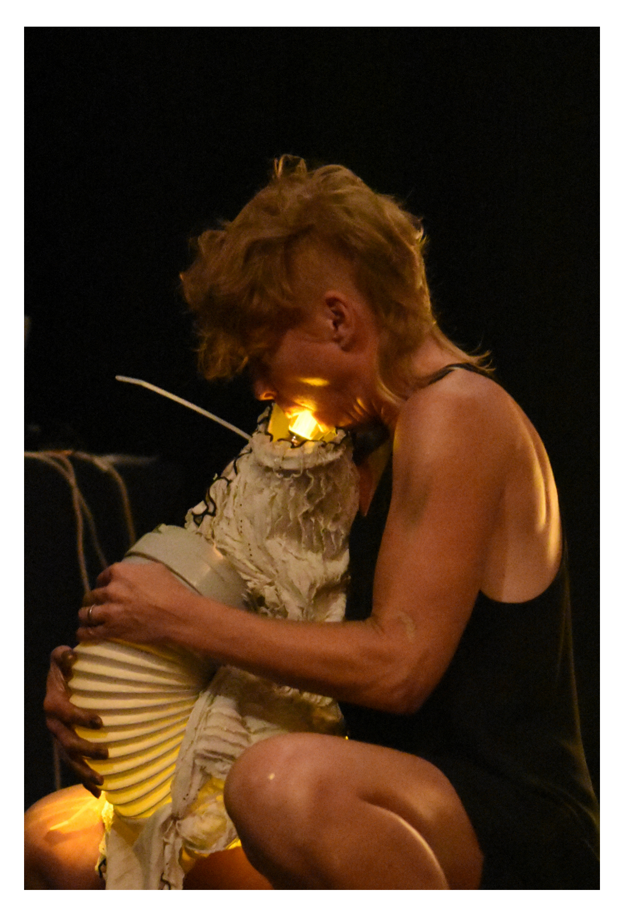
Gold Test Intestine, 2018