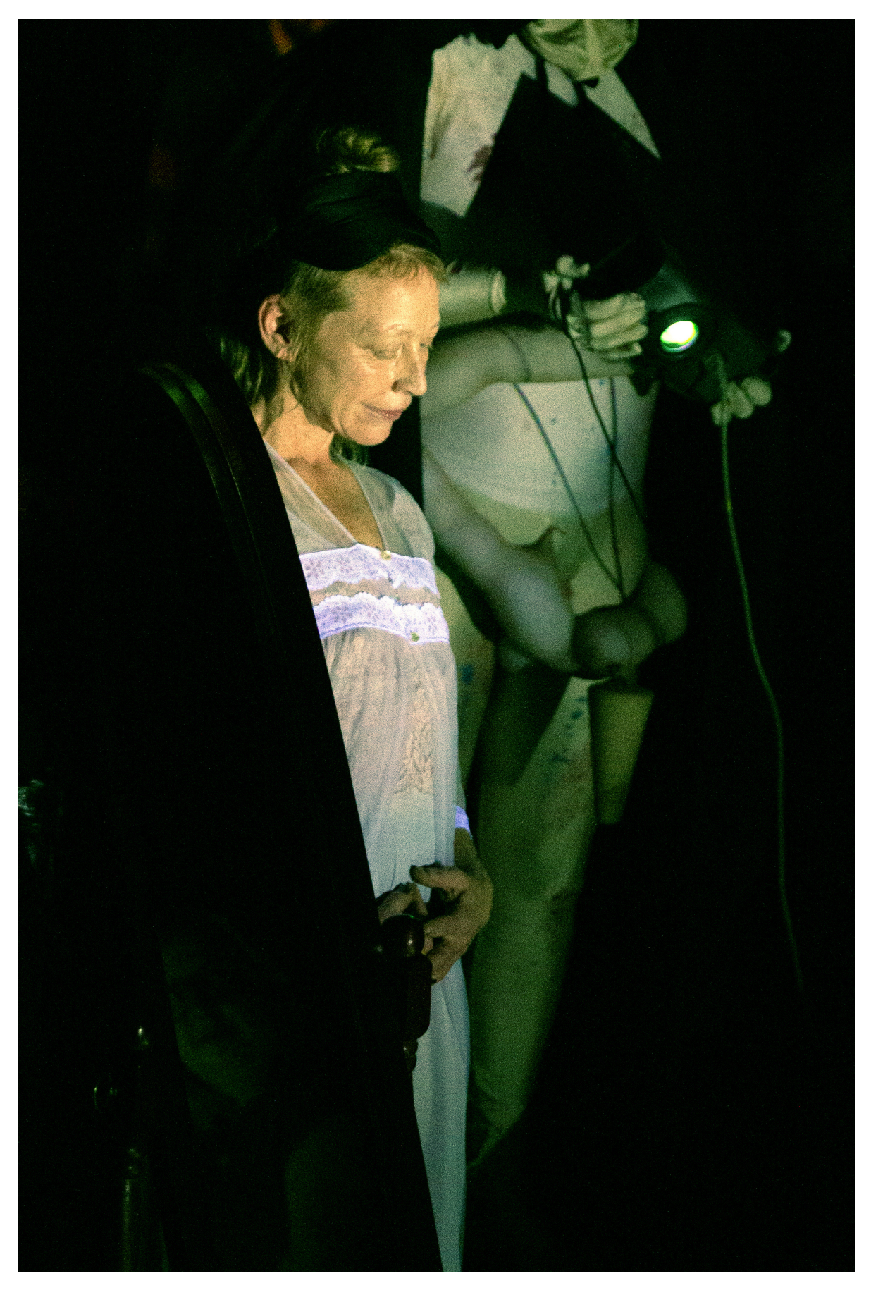
No Edge, 2019