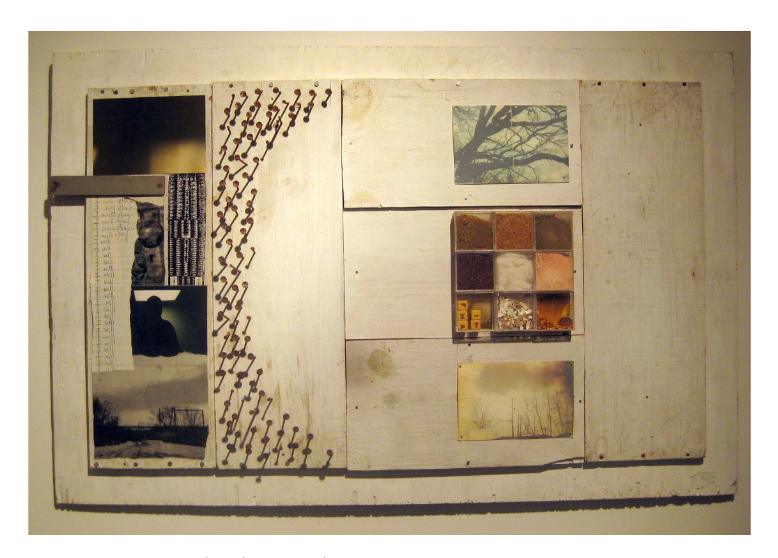
NO LONGER, 2003, mixed media on wood, 24" x 36" x 3"