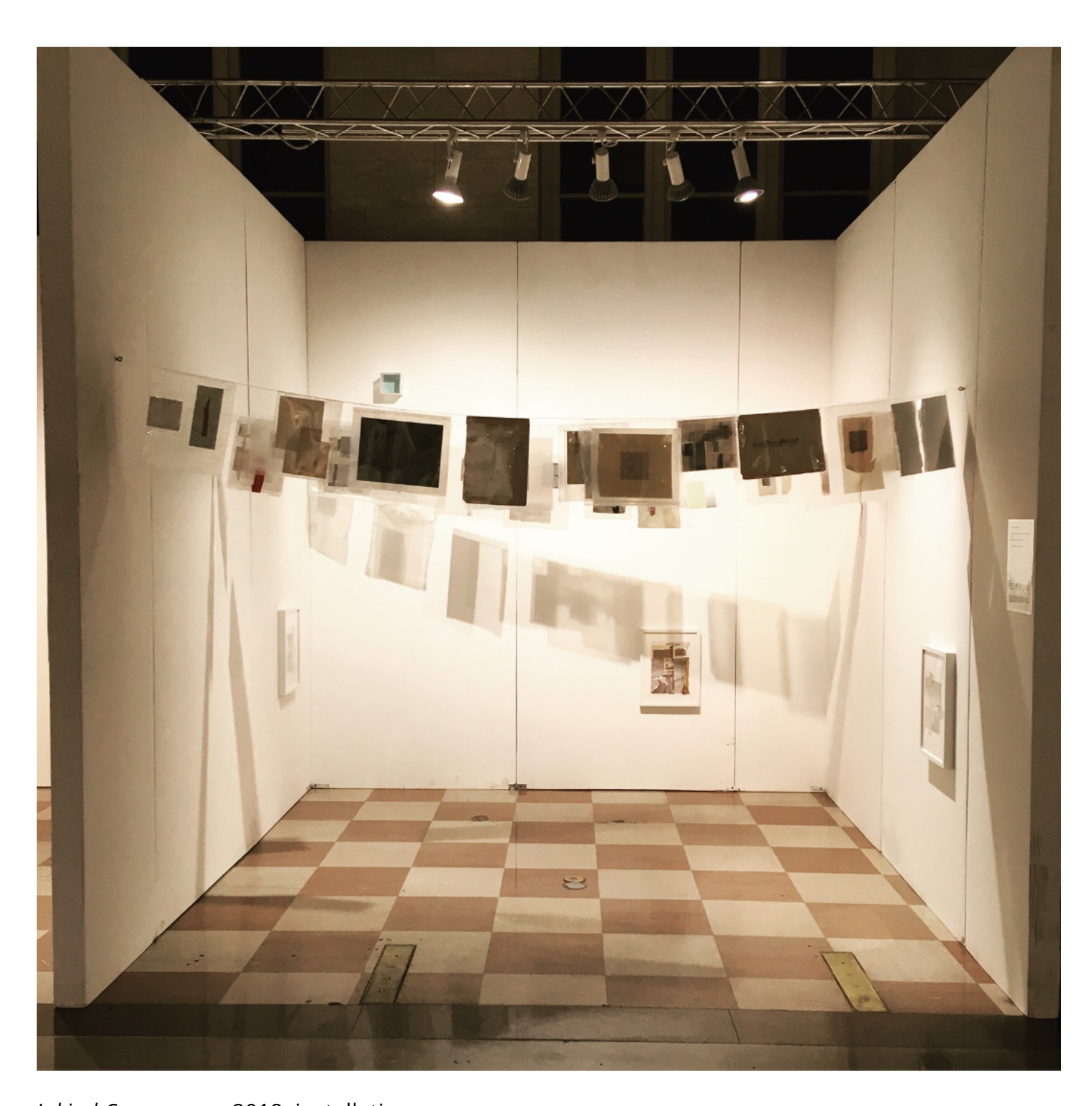
Inkind Conveyance , 2018, installation