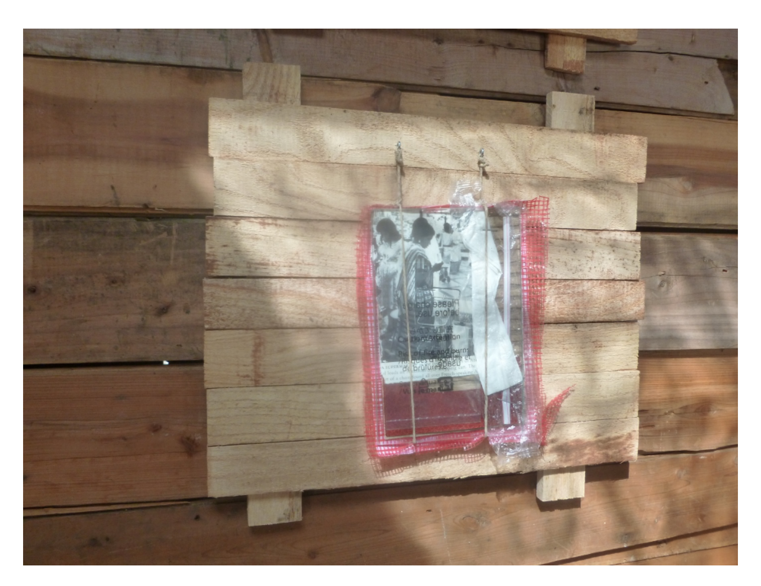
No Away to Throw To I, 2013, mixed media on wood