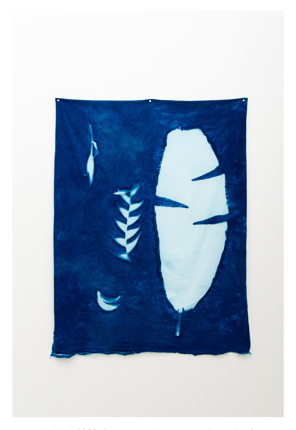
Untitled, 2023, Cyanotype print on cotton, dimensions?