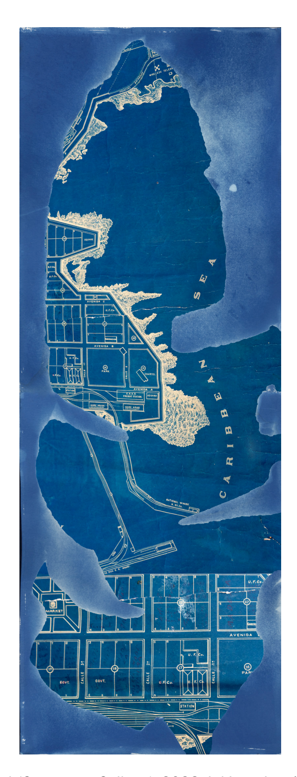
Untitled (Cyanotype Collage), 2023, Inkjet print, 11' x 7'