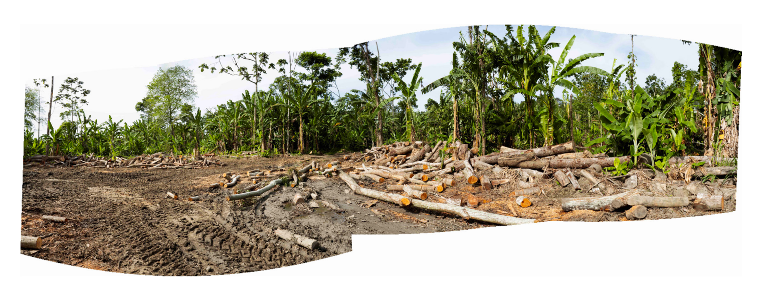
Limon Banana Farming, 2023, Phototex, 25'