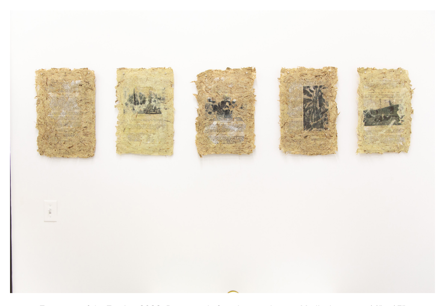
Treasures of the Tropics, 2023, Paper made from banana leaves, Medical sutures, 11" x 15"