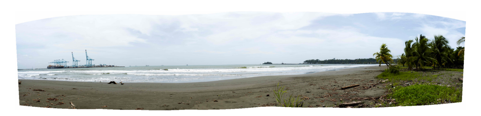
Beach of Limon, Costa Rica, 2023, Phototex, 27' x 5'