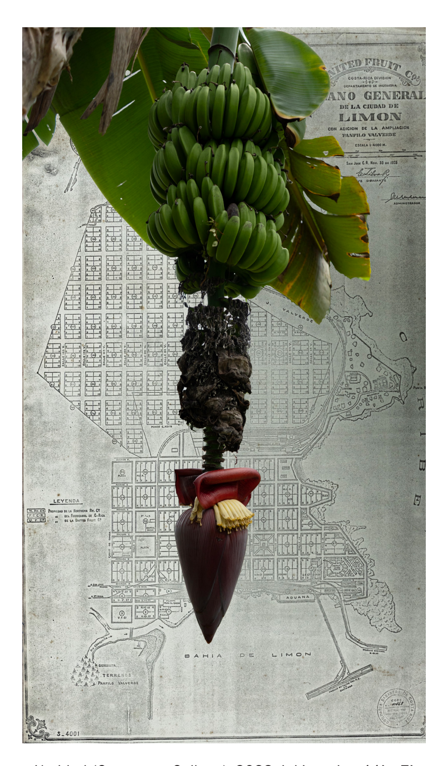
Untitled (Cyanotype Collage), 2023, Inkjet print, 11' x 7'