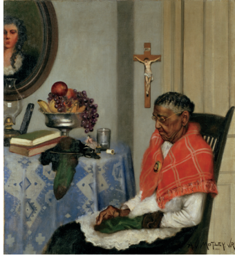
Archibald J. Motley Jr., Mending Socks , 1924. Oil on canvas, 43.875 x 40 inches (111.4 x 101.6 cm). Ackland Art Museum, The University of North Carolina at Chapel Hill. Burton Emmett Collection, 58.1.2801.