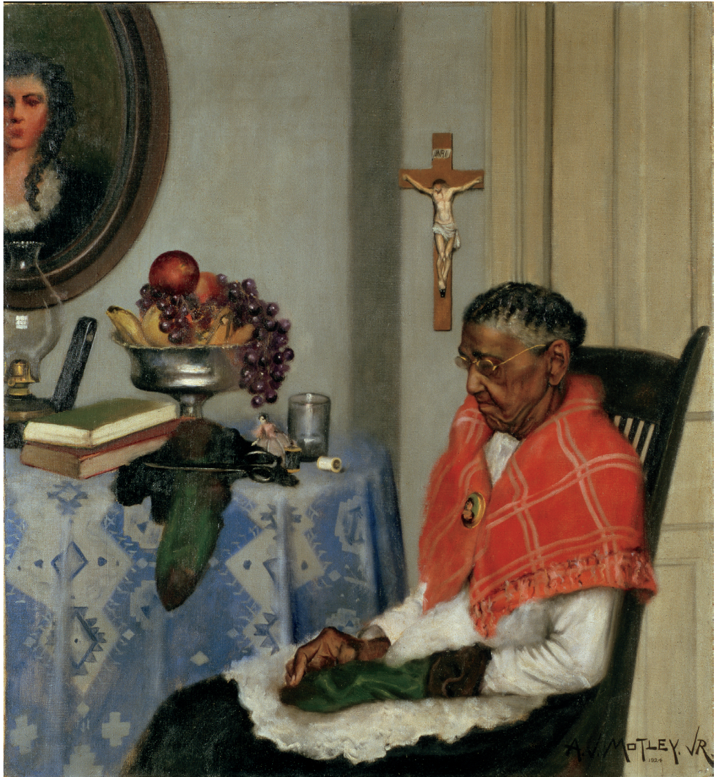
Archibald J. Motley Jr., Mending Socks 1924. Oil on canvas, 43.875 x 40 inches (111.4 x 101.6 cm). Ackland Art Museum, The University of North Carolina at Chapel Hill. Burton Emmett Collection, 58.1.2801.