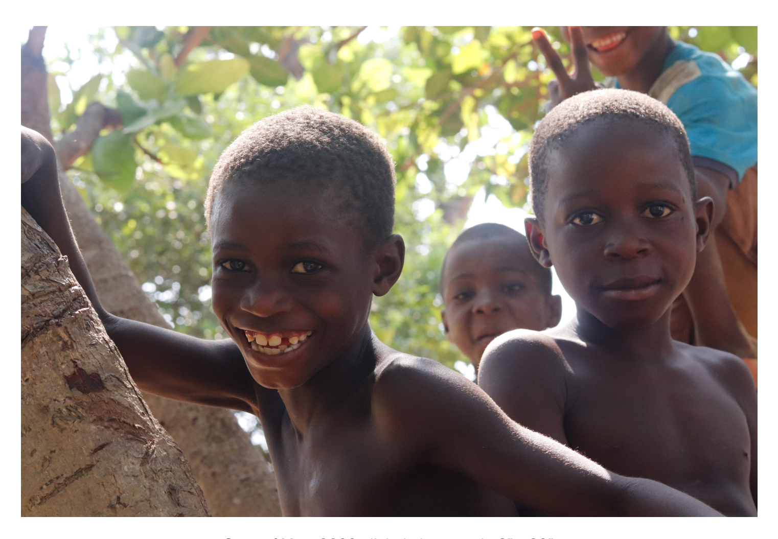
Sons of Man, 2022, digital photograph, 8" x 32"