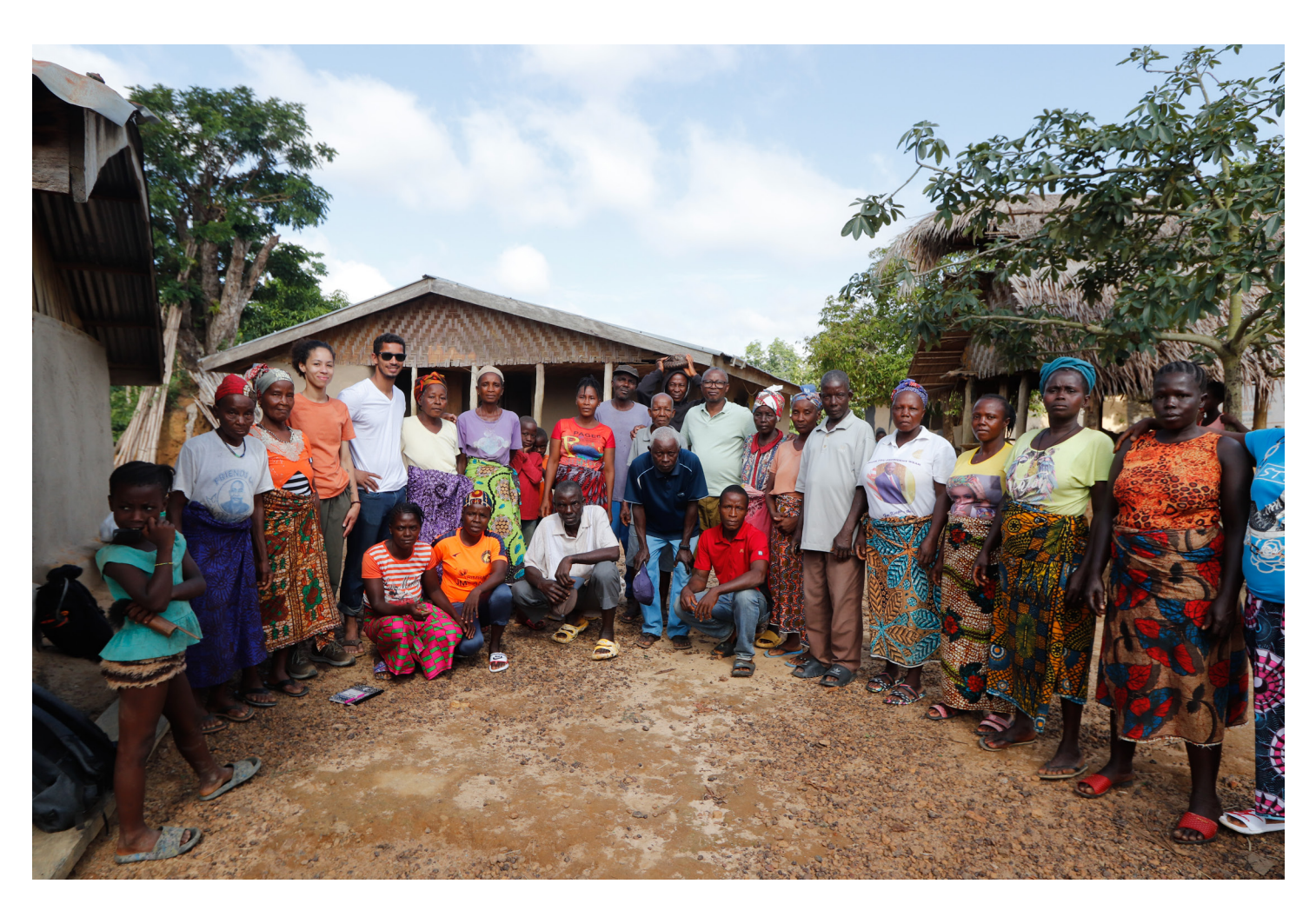
Bonokollie Tribe, 2022, digital photograph, 8" x 32"