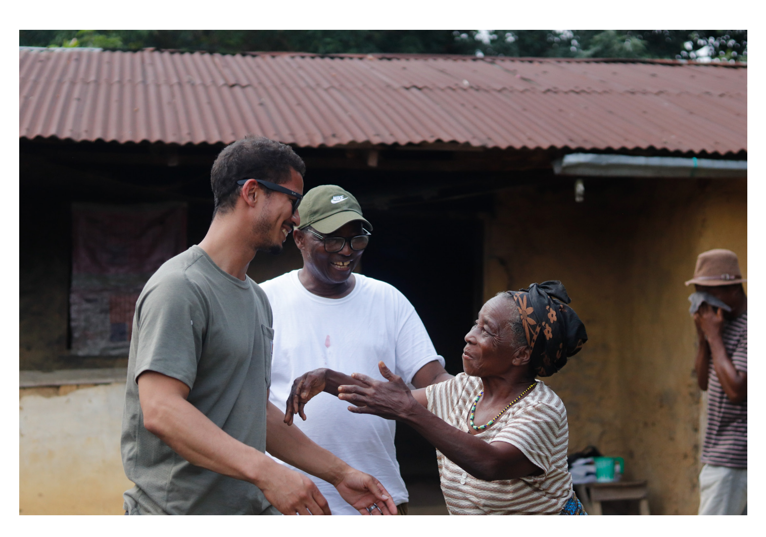
Great Auntie, 2022, digital photograph, 8" x 32"