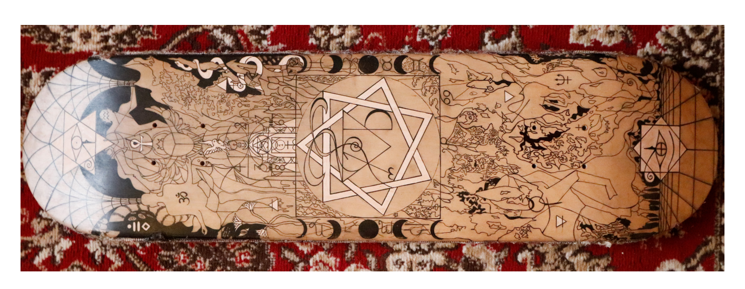
Soul Talisman, 2023, ink on skateboard, 8" x 32"