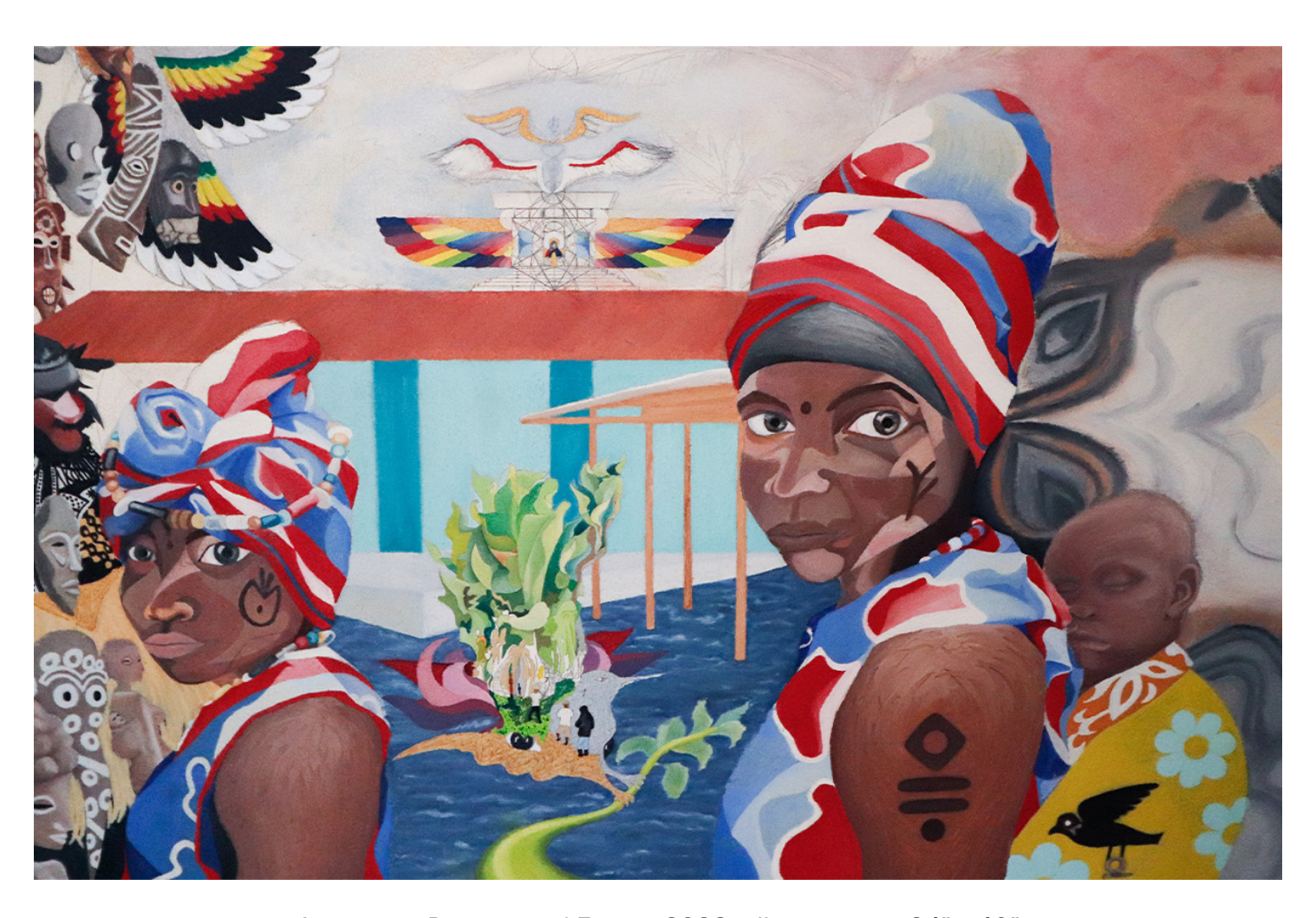
Ancestors, Present and Future, 2023, oil on canvas, 24" x 40"