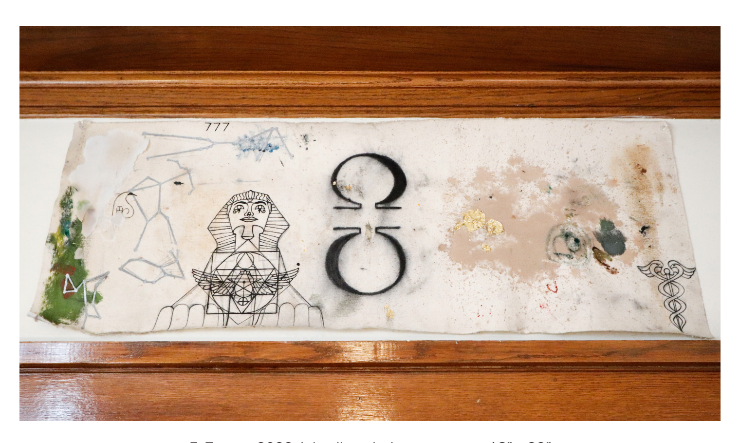
EnTrance, 2022, ink, oil, and wine on canvas, 18" x 32" \,