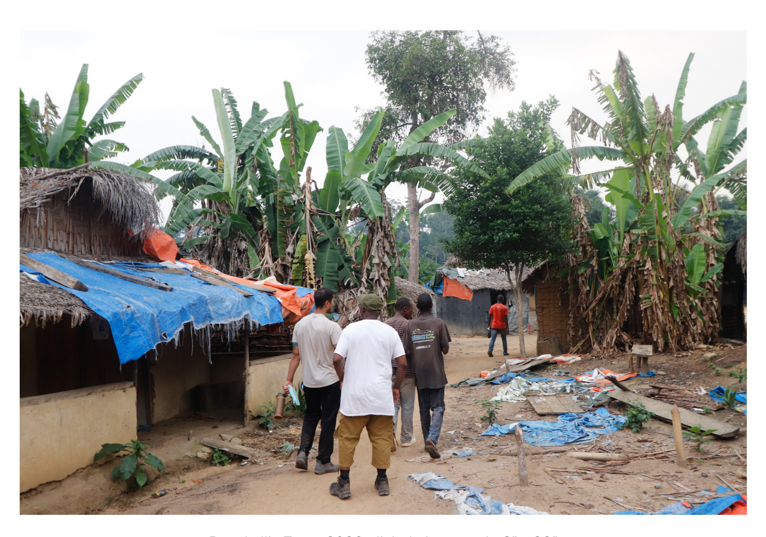
Bonokollie Town, 2022, digital photograph, 8" x 32"