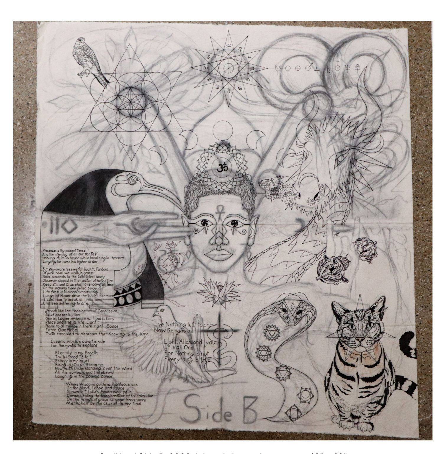
GodHead\ Side\ B,\ 2023,\ ink\ and\ charcoal\ on\ canvas,\ 42"\ x\ 42"