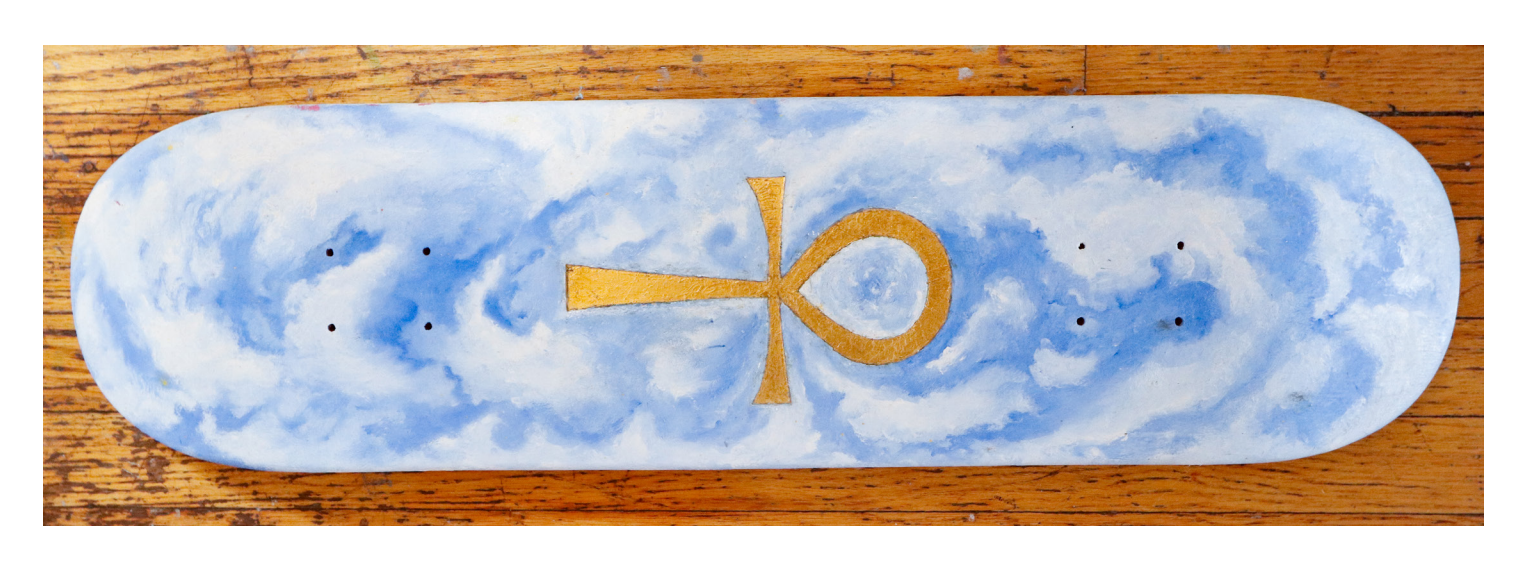
Breath of Life, 2023, ink on skateboard, 8" x 32"