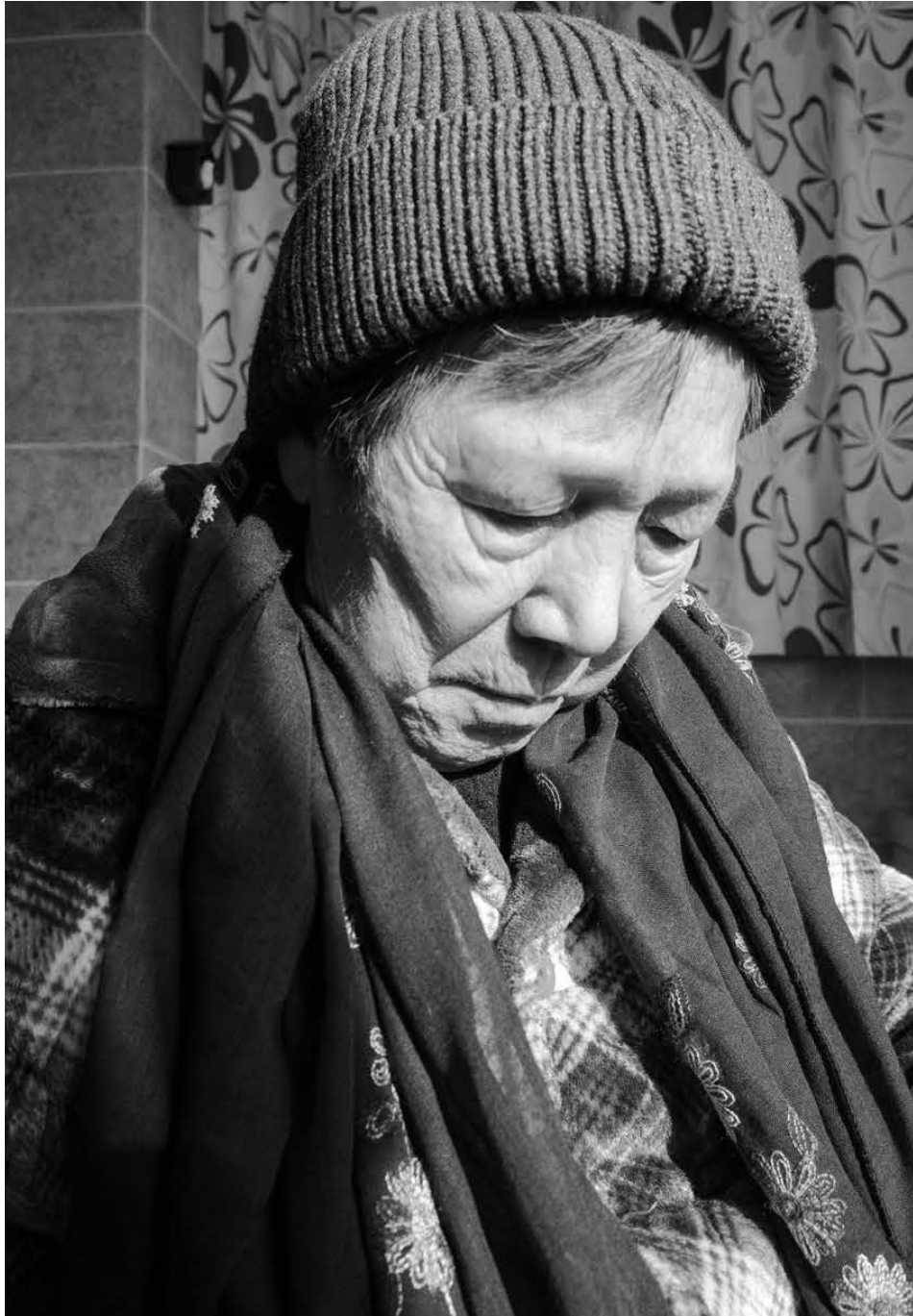
Sunset in the room, #9, 2020, inkjet print