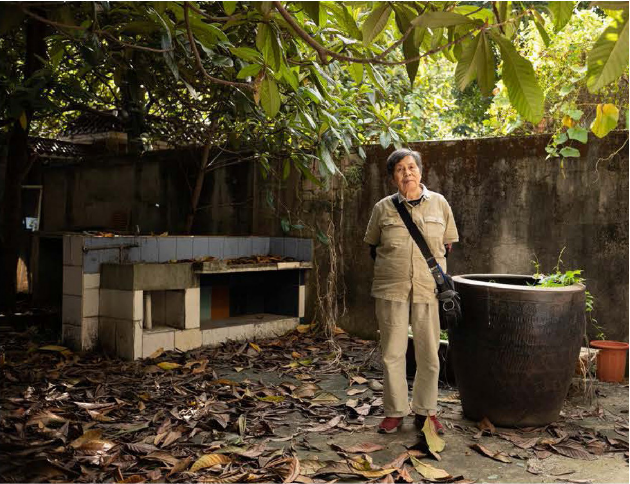
Sunset in the room, #7, 2020, inkjet print