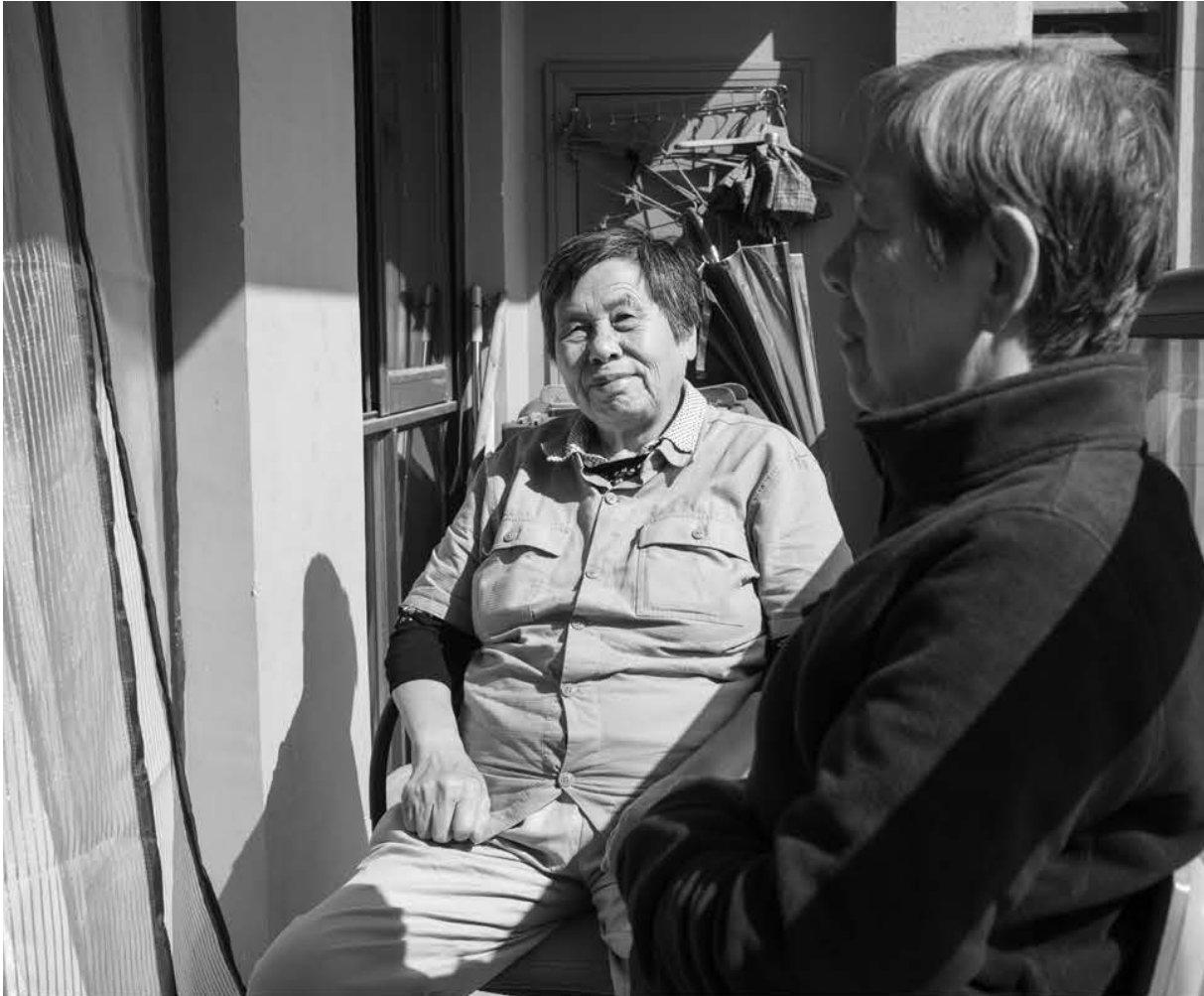
Sunset in the room, #8, 2020, inkjet print