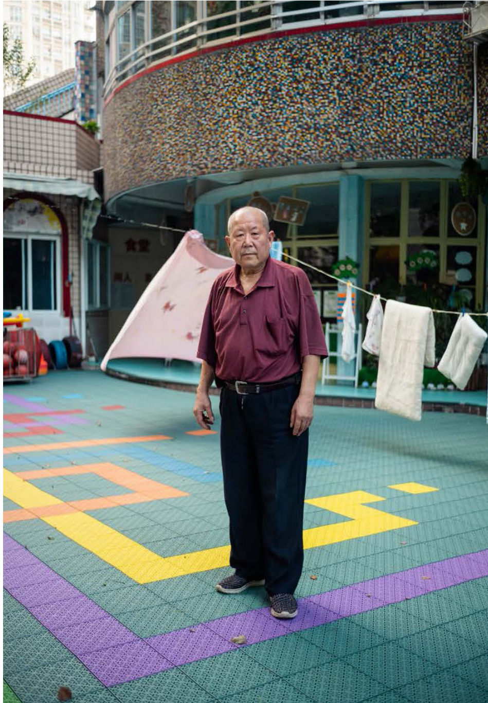
Sunset in the room, #5, 2020, inkjet print