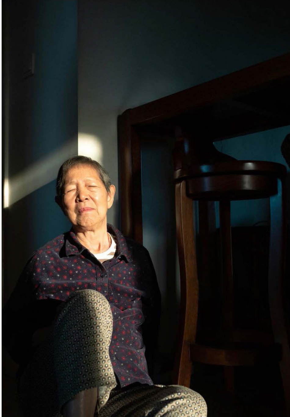
Sunset in the room, #10, 2020, inkjet print