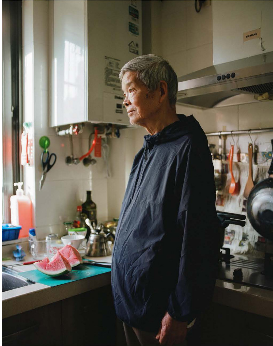
Sunset in the room, #6, 2020, inkjet print