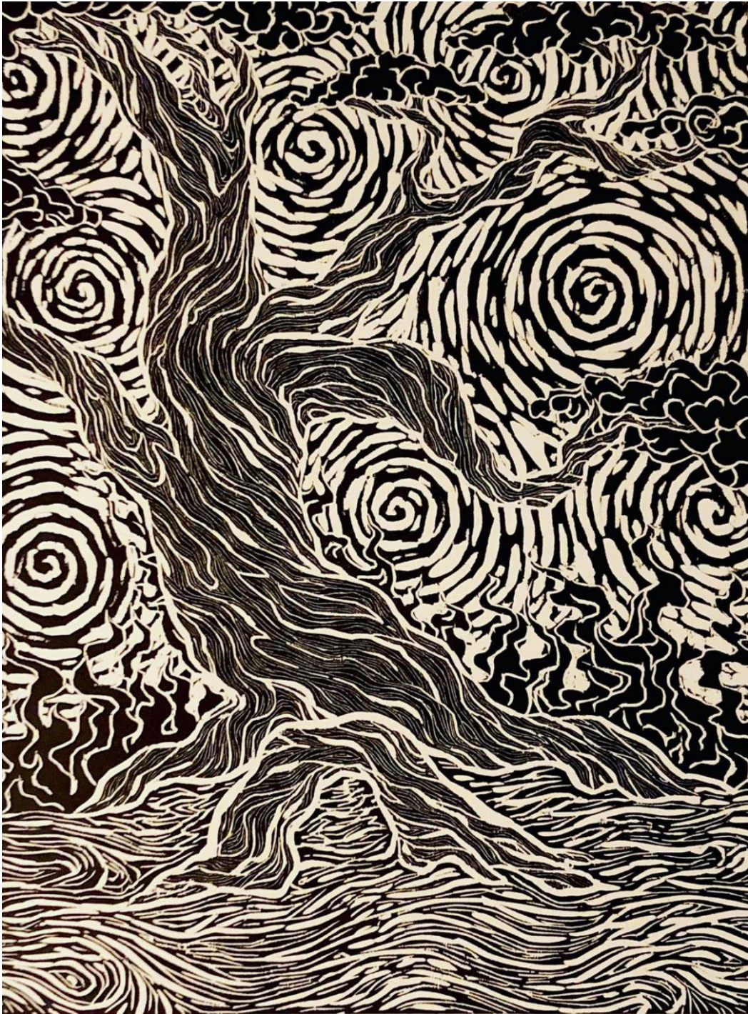
Mesmerism , 2021, woodcut/relief print, 12" x 9"