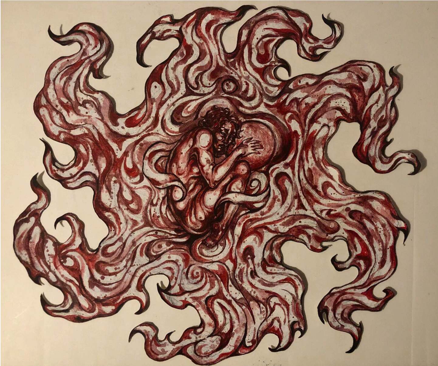
Afterbirth , 2023, acrylic paint and Sharpie marker, 18" x 20"