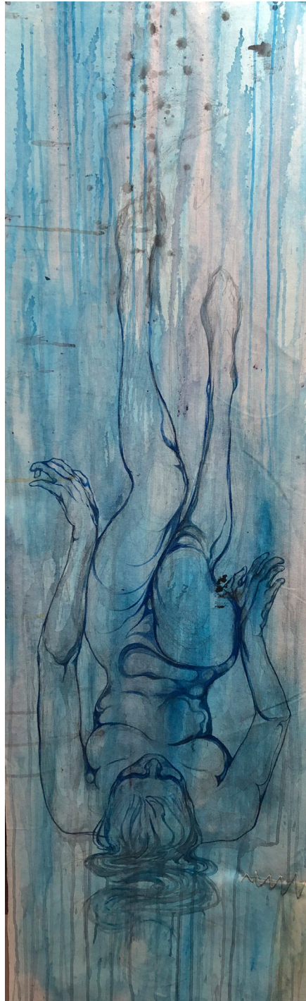
Droplet , 2023, acrylic paint and Brazilian chord, 60" x 19"