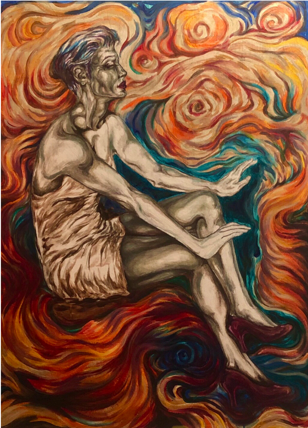
Fire and Ice , 2023, acrylic paint, 38.5" x 28"