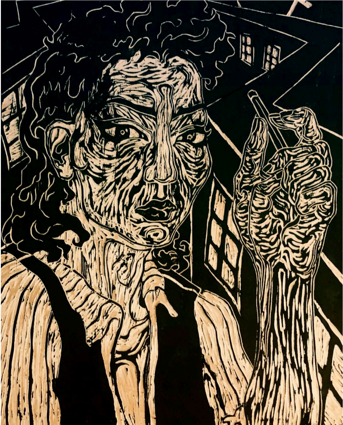
Self Portrait: The Cabinet, 2021, 12" x 9"