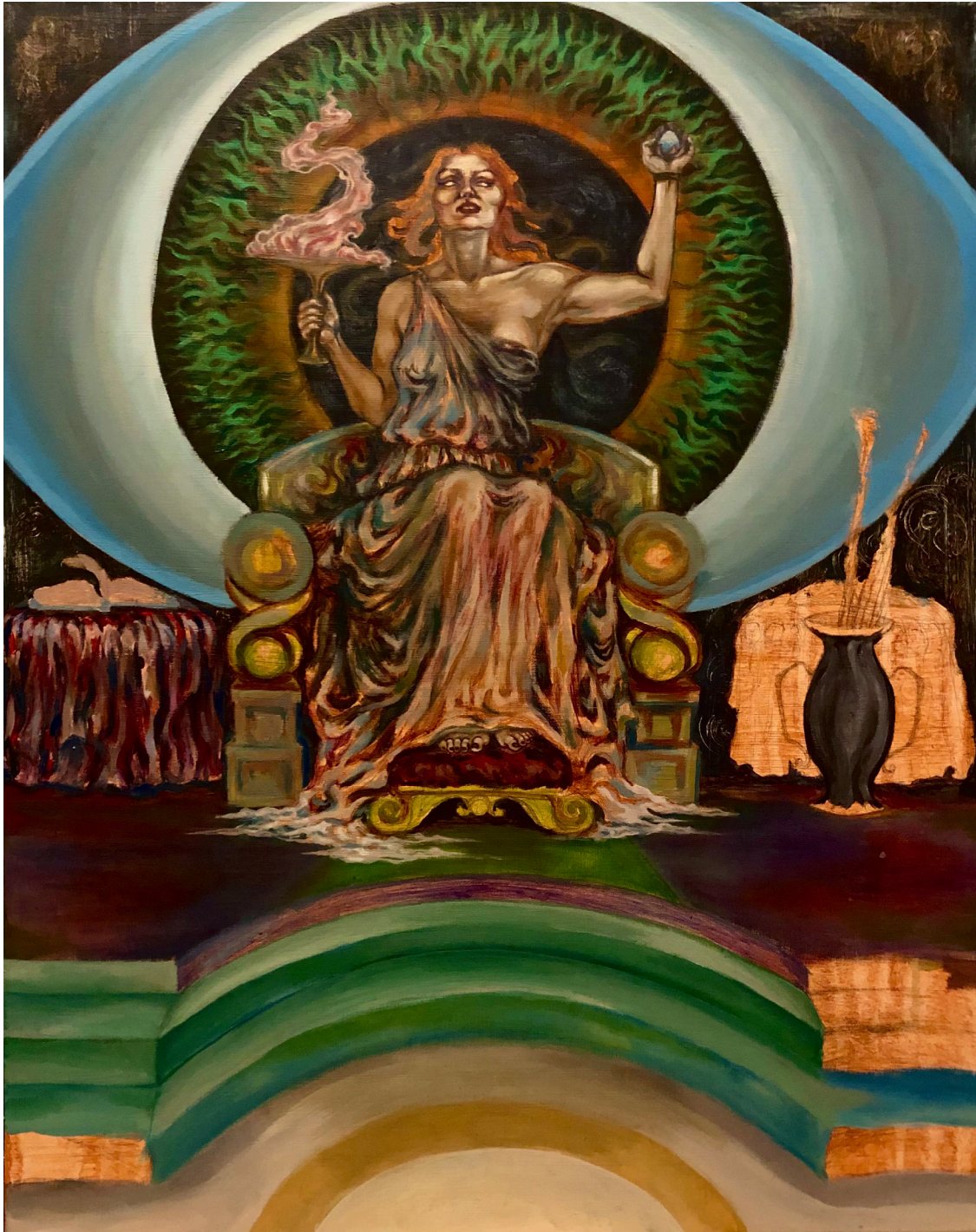
Goddess 2: Healing , 2023, acrylic paint, 30" x 24"