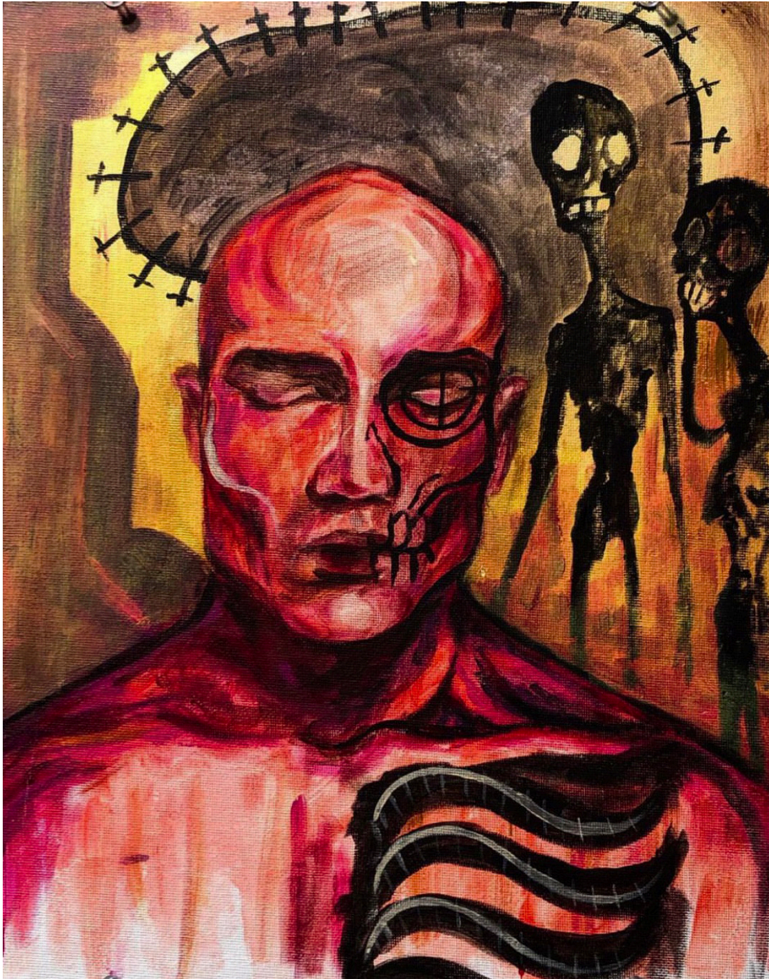
Skeletal Symptoms , 2022, acrylic on panel, 14" x 11"