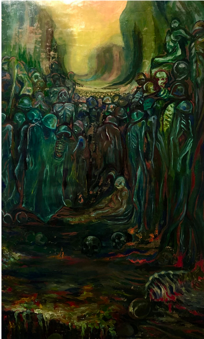
Collective: A Study of Beksinski , 2022-2023, oil paint and paper on canvas, 41" x 25"