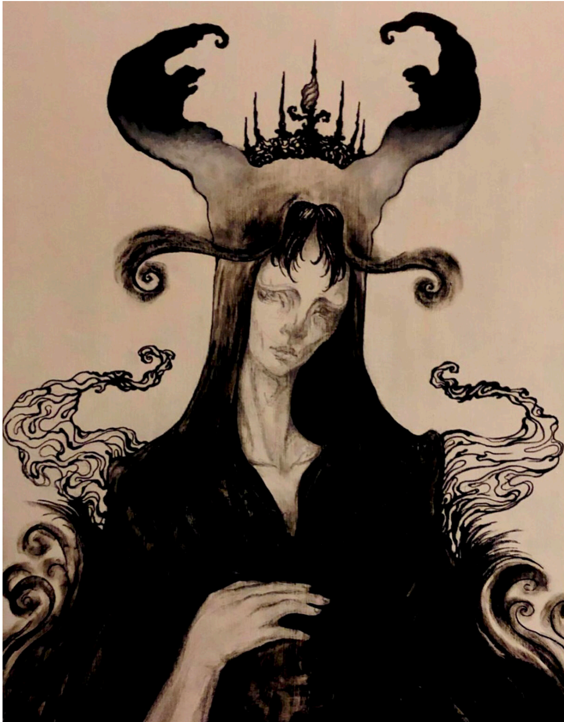
Celestial Mother , 2022, acrylic paint, Sharpie marker, graphite, and ink, 24" x 19"