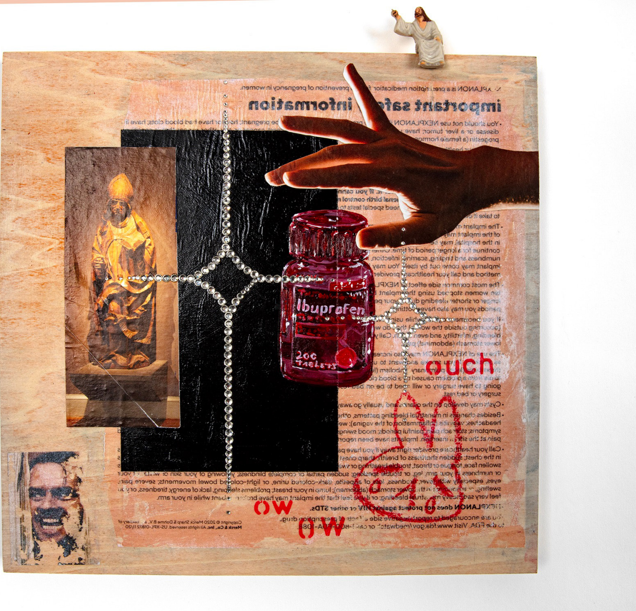
Ibuprophet, 2022, mixed media collage, 10" x 10"