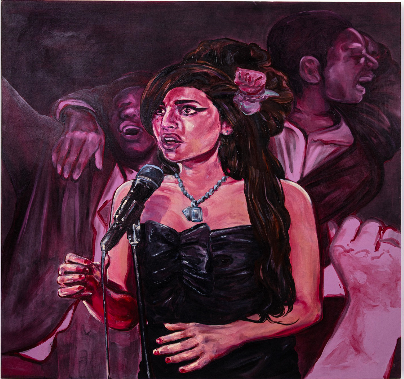
Baby You'll Be Famous (Follow You Until You Love Me) , 2023, oil on wood panel, 30" x 30"