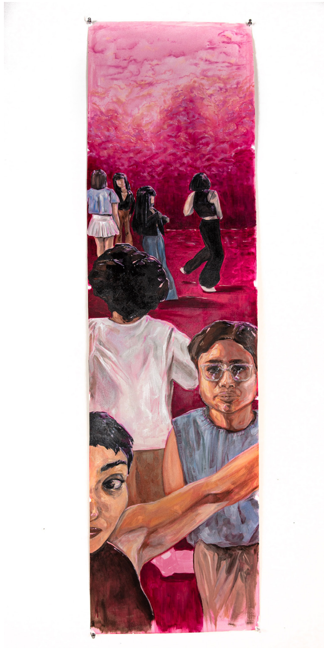
In Passing , 2022, oil on unstretched canvas, 62" x 16"