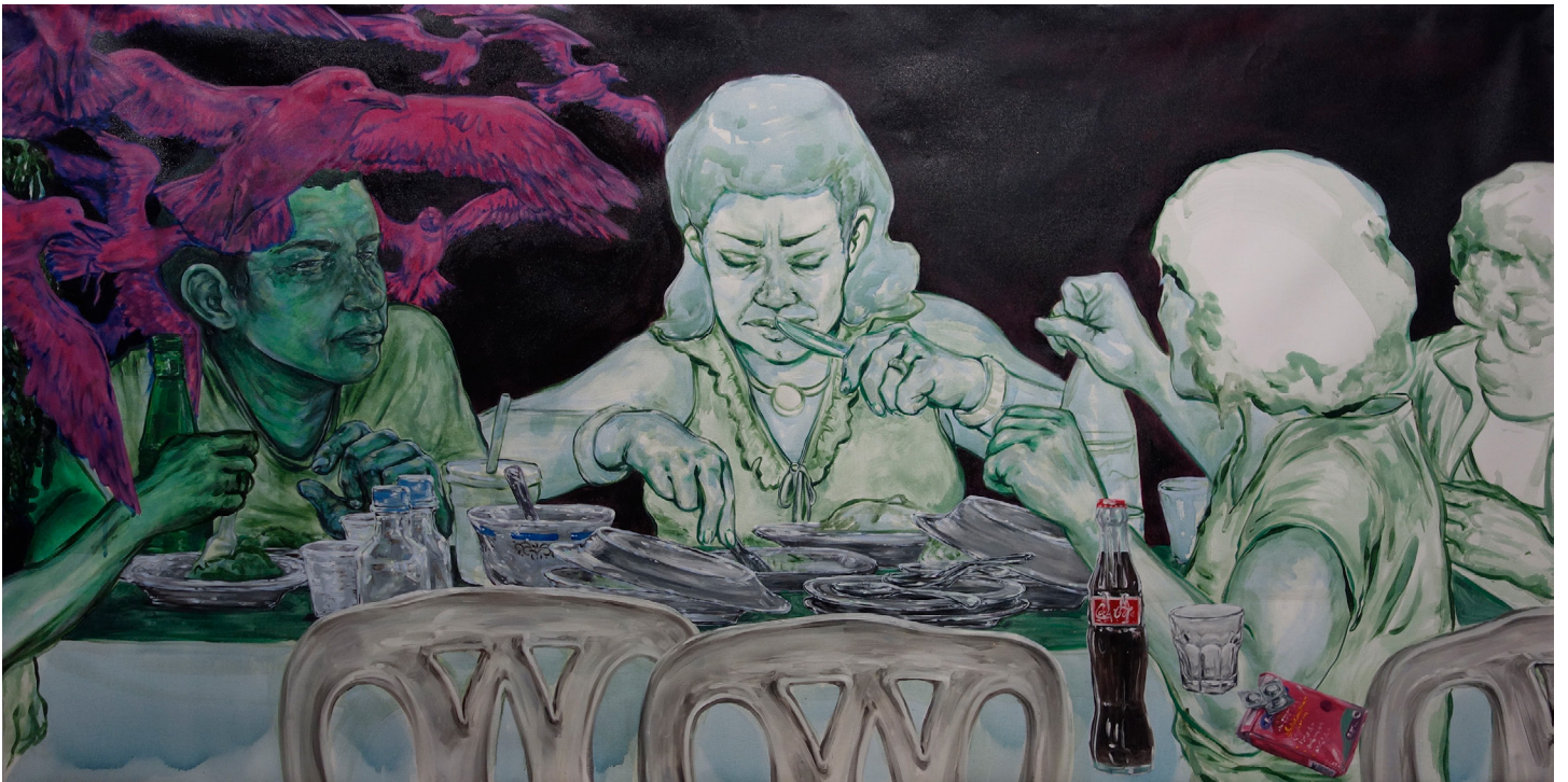
Ghost Tricking , 2023, acrylic and oil on unstretched canvas, 36" x 72"