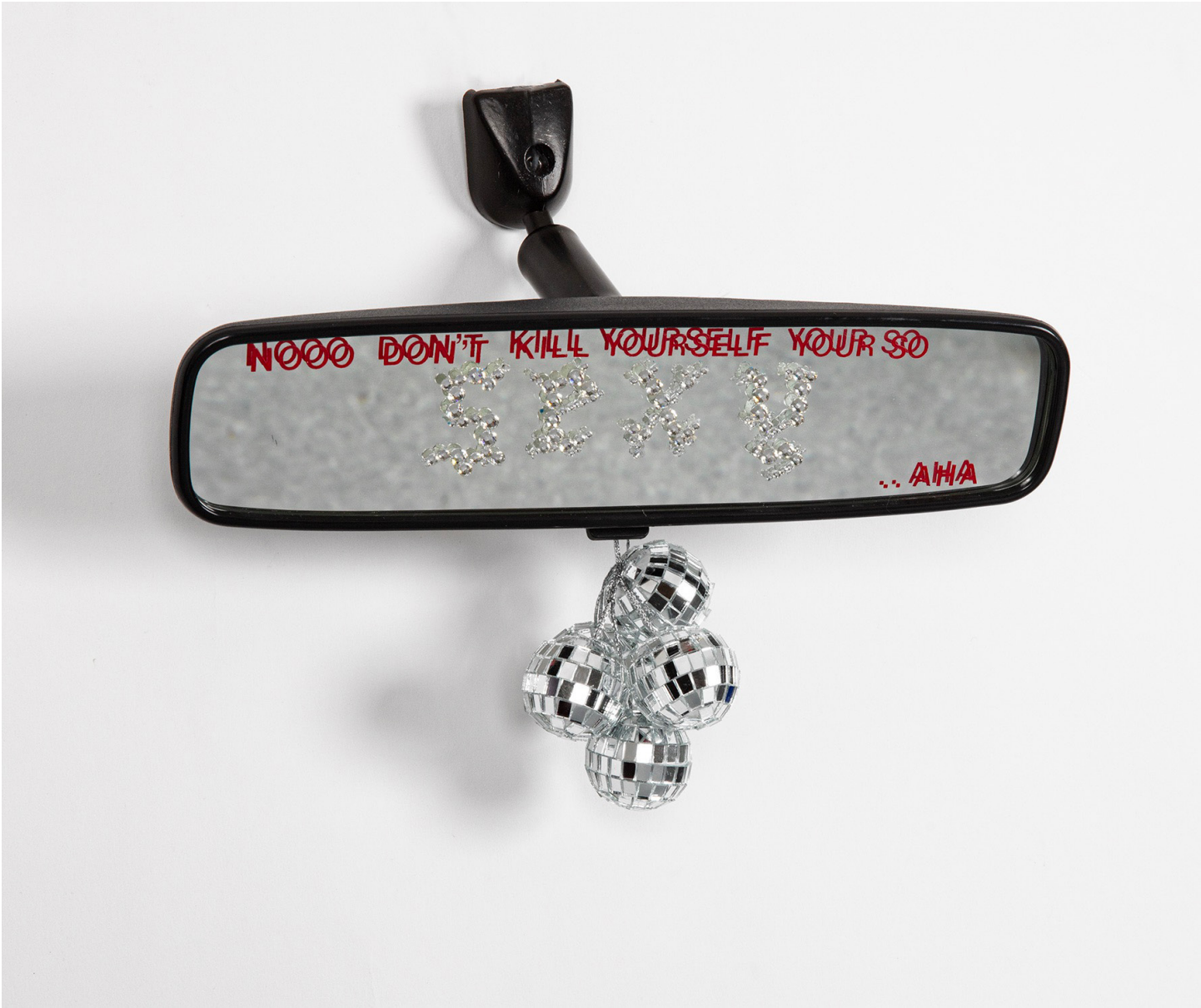
Wrong Your For Authenticity, 2022, rearview mirror, vinyl text, rhinestones, disco balls