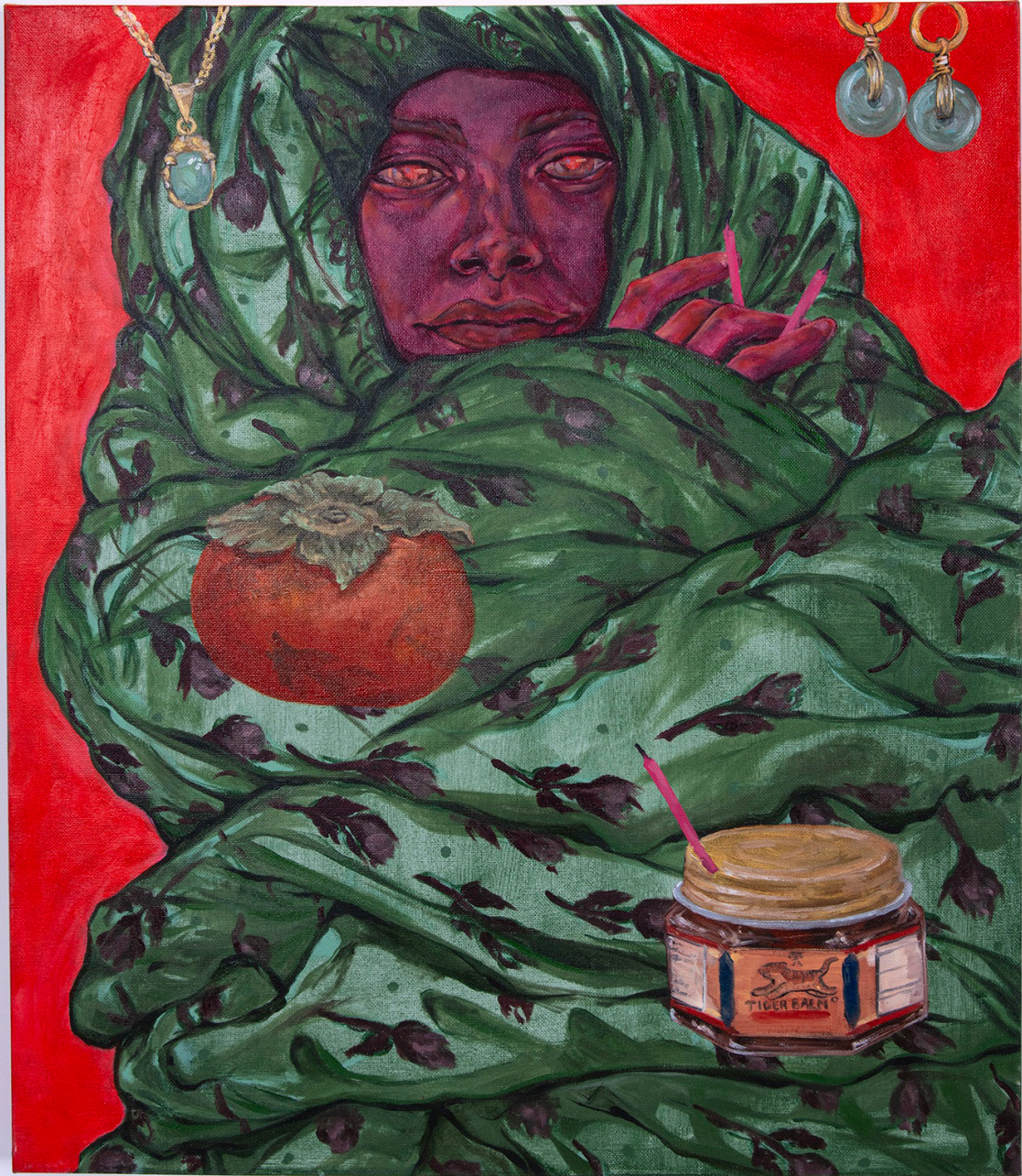
Do U Wanna? , 2022, oil on canvas, 24" x 20"