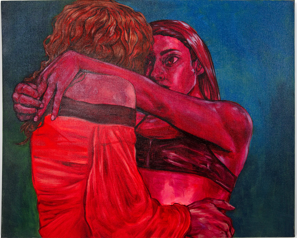
The Smell of Chlorine, The Passing of Time, 2022, oil on canvas, 20" x 24"