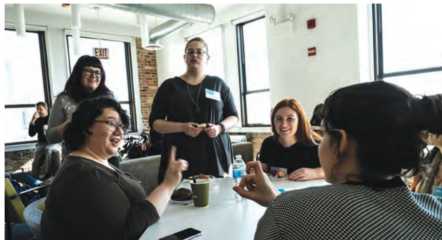
In 2018, hundreds of alumni, faculty, students, and staff gathered to celebrate the 25th anniversary of the ASL program.

At Columbia, the ASL Department includes coursework—and attracts students—from other creative fields such as theatre, creative writing, fashion studies, and more. Alumni have worked in diverse environments: schools; renowned theaters such as the Goodman, Lookingglass, and Steppenwolf; and even as official interpreters for the White House.