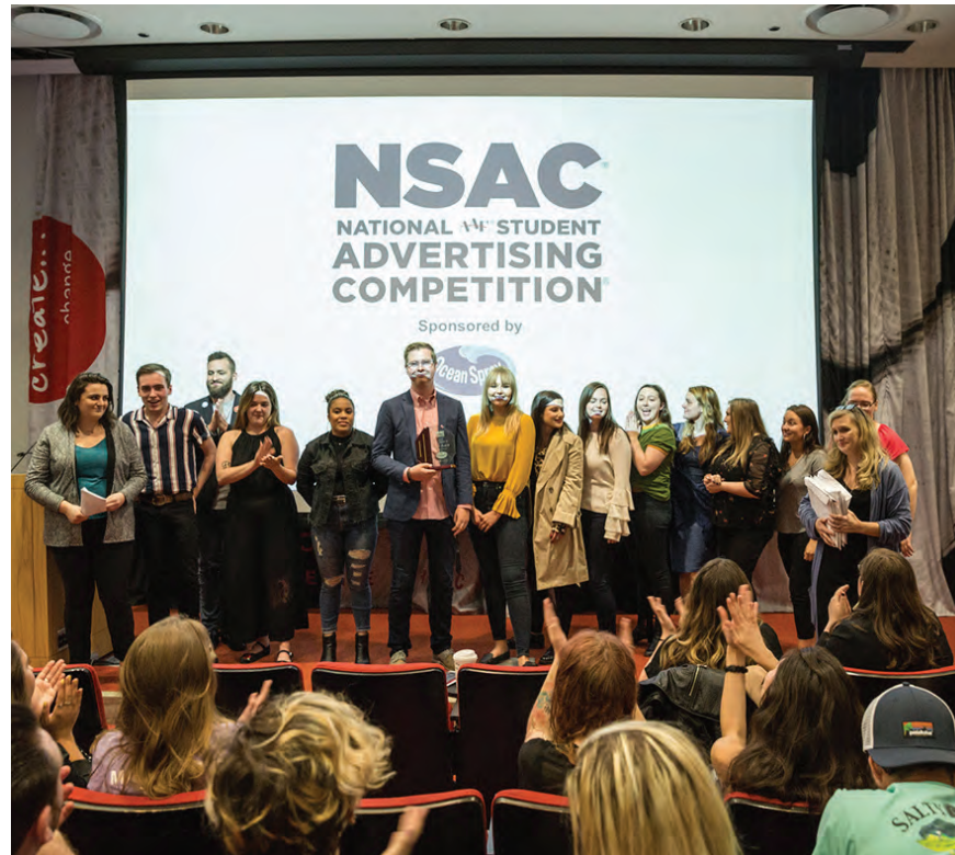
Columbia's student advertising team won fourth place out of 140 teams in a national competition.