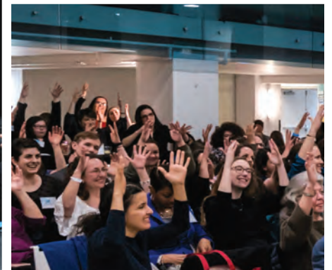
Columbia's ASL program began in 1993 as the only four-year interpretation program in the Midwest.