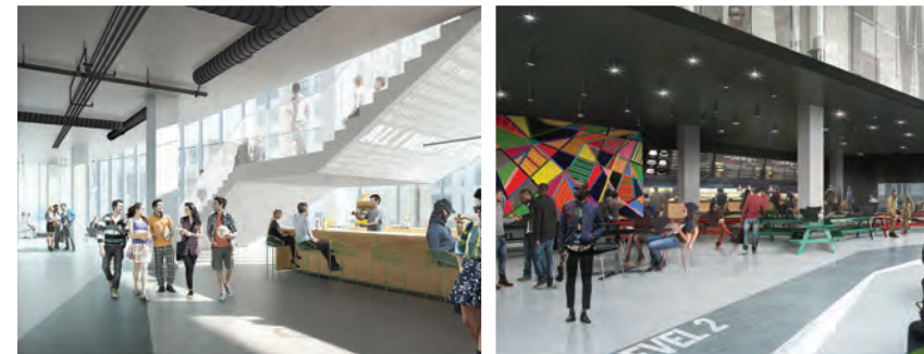
Columbia's first-ever Student Center will open in 2019.