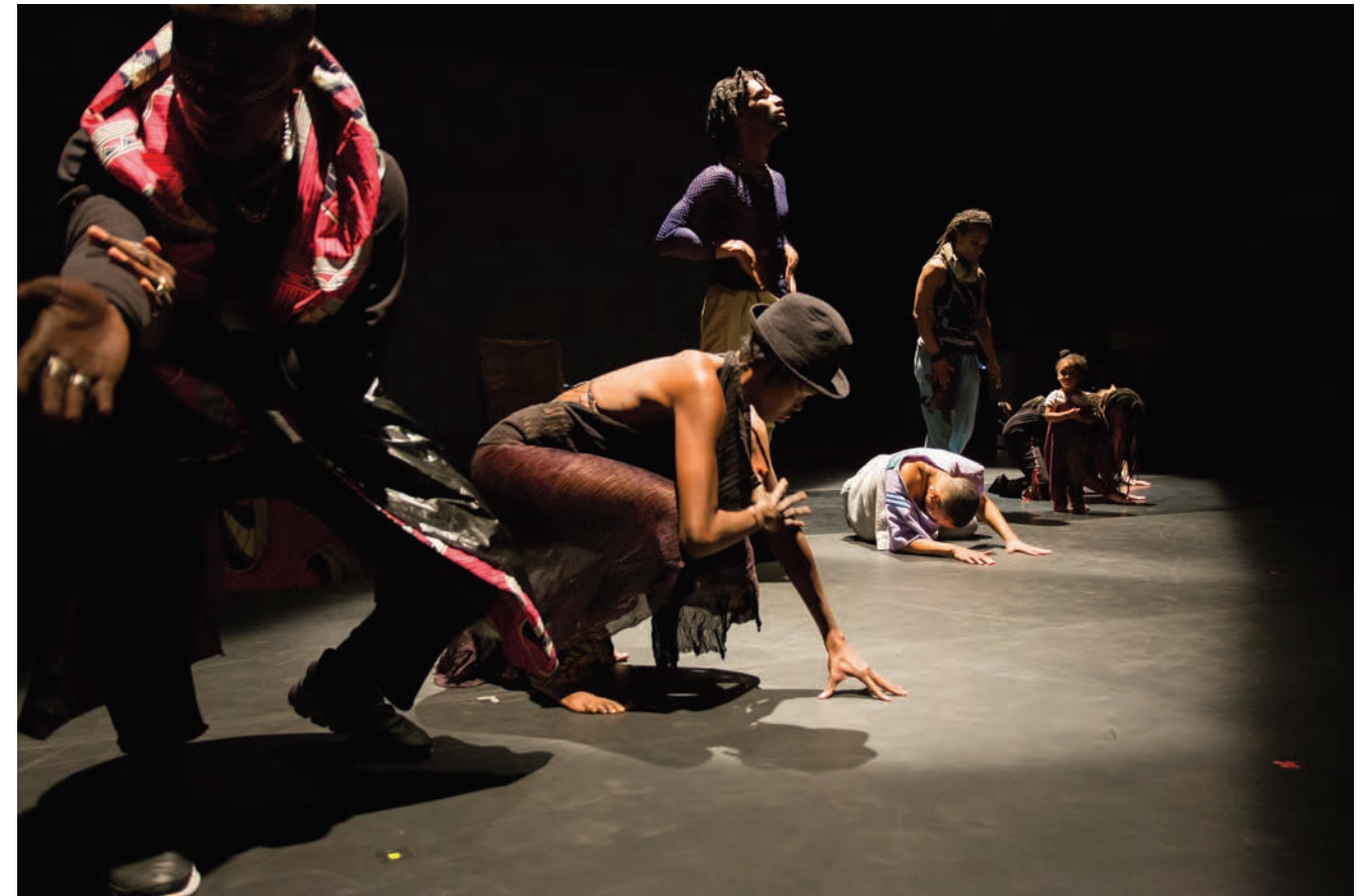
Urban Bush Women perform Hair & Other Stories.