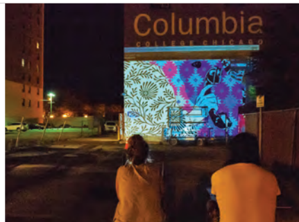
The mural art exchange between Chicago and Toronto, Canada, is part of an ongoing effort to strengthen the international relationship between the two cities.