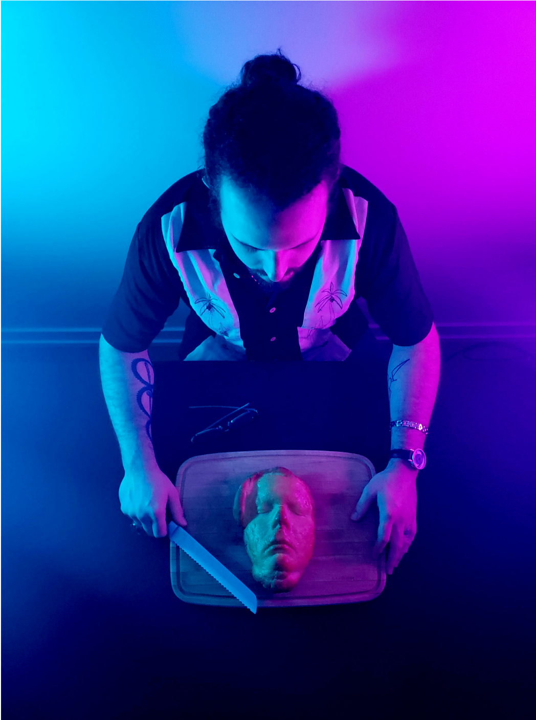
To Break , 2021