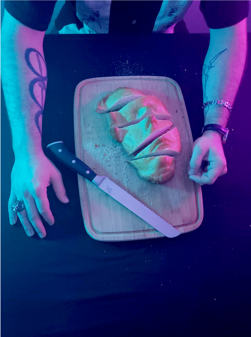
To Break , 2021, photo courtesy of the artist