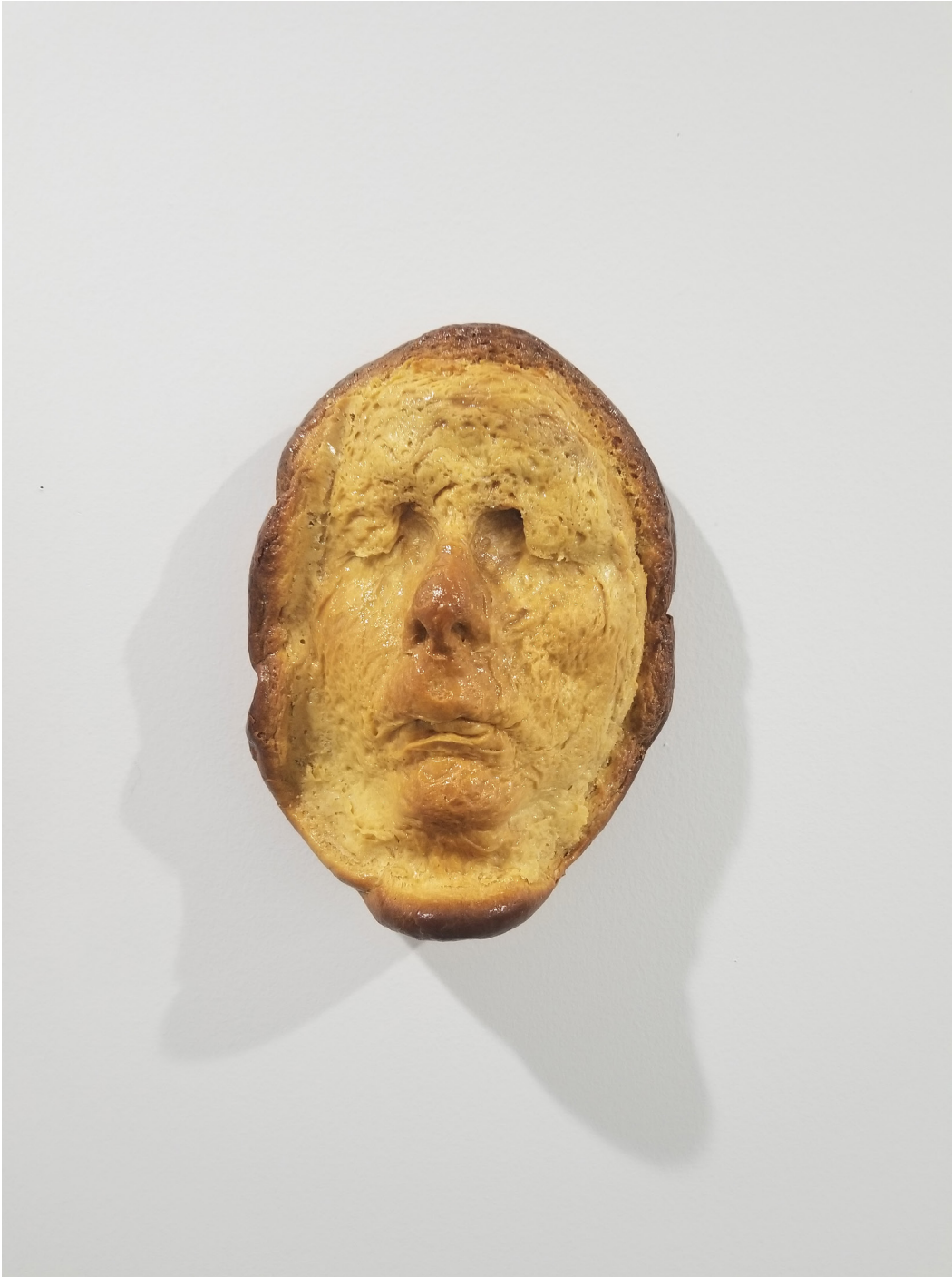
To Break , 2021