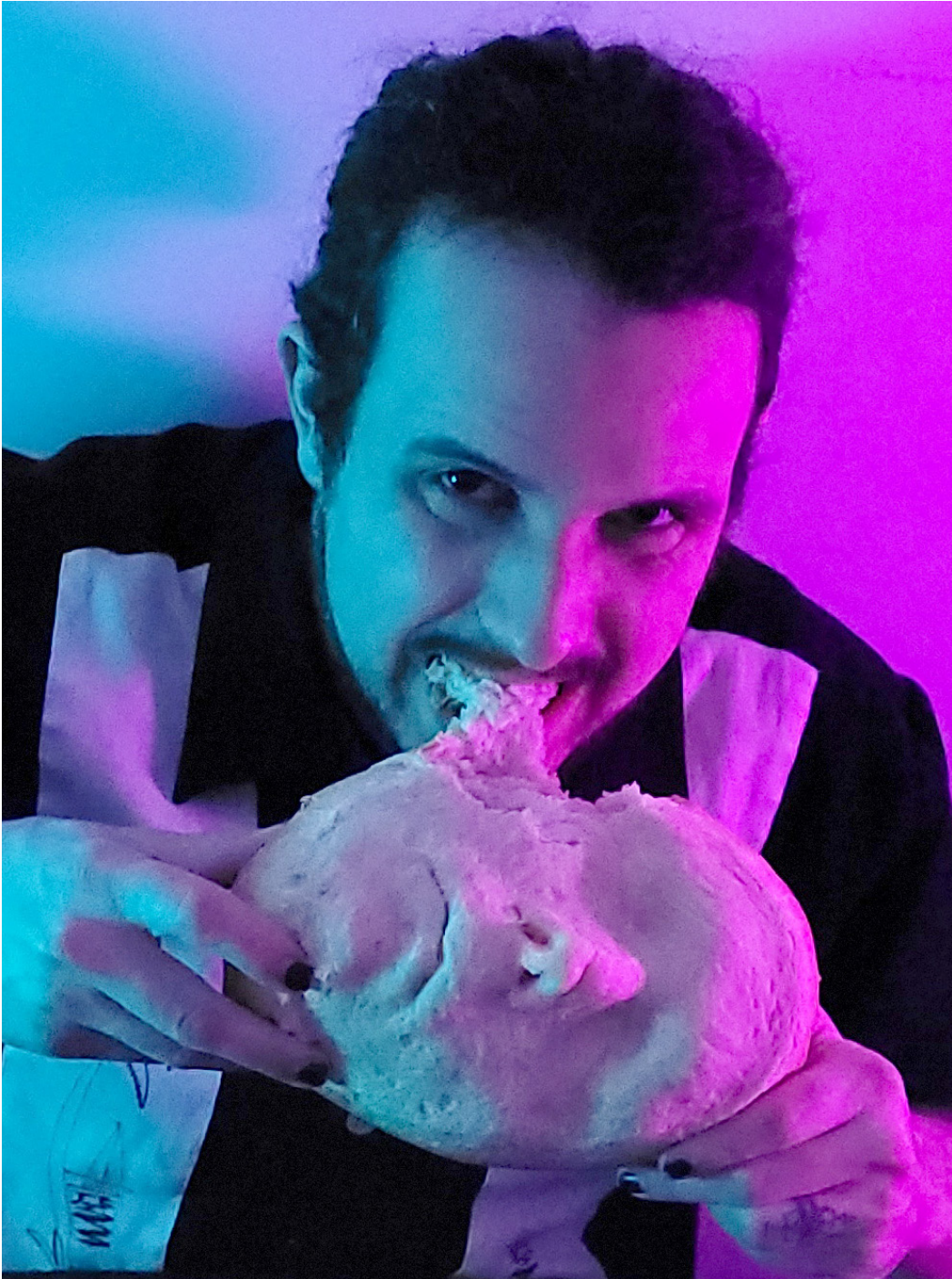
To Break , 2021