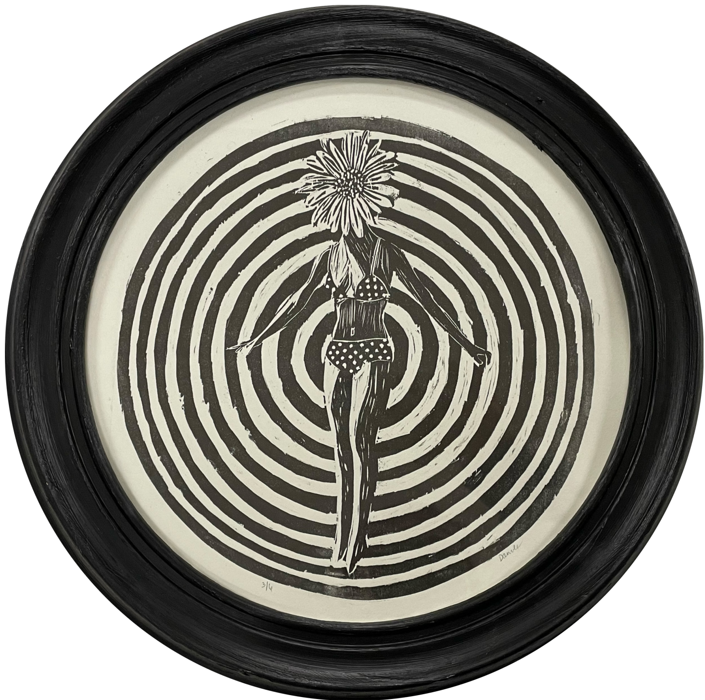
Vortex, framed relief print, 12" x 12"