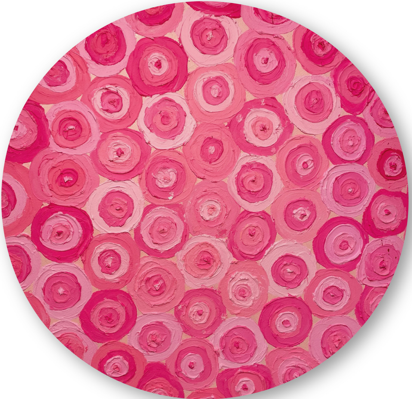
Sorry You're Gone , oil paint and cold wax on round canvas, 10" x 10"