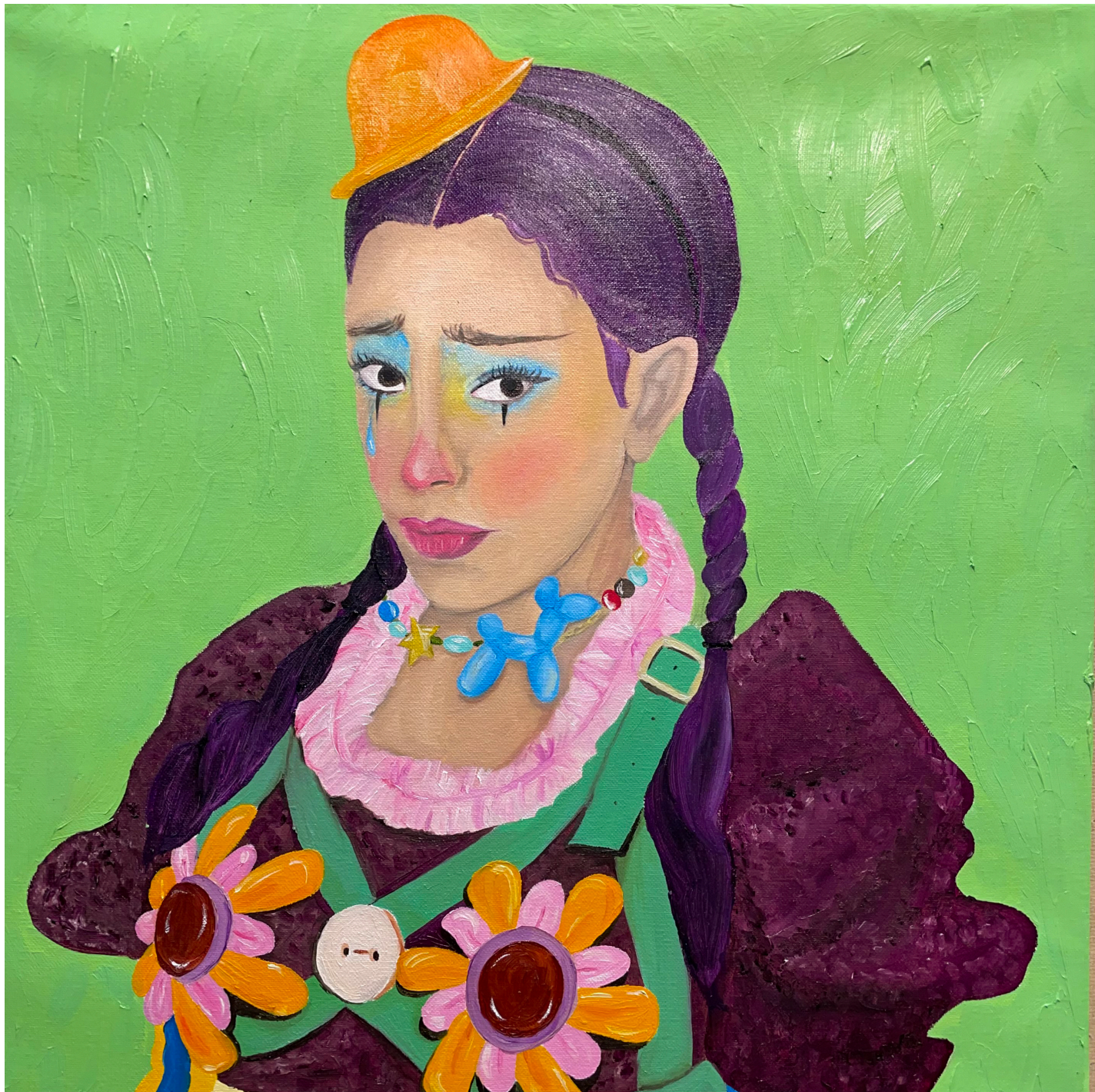
Sad Clown , oil on canvas, 20" x 16"