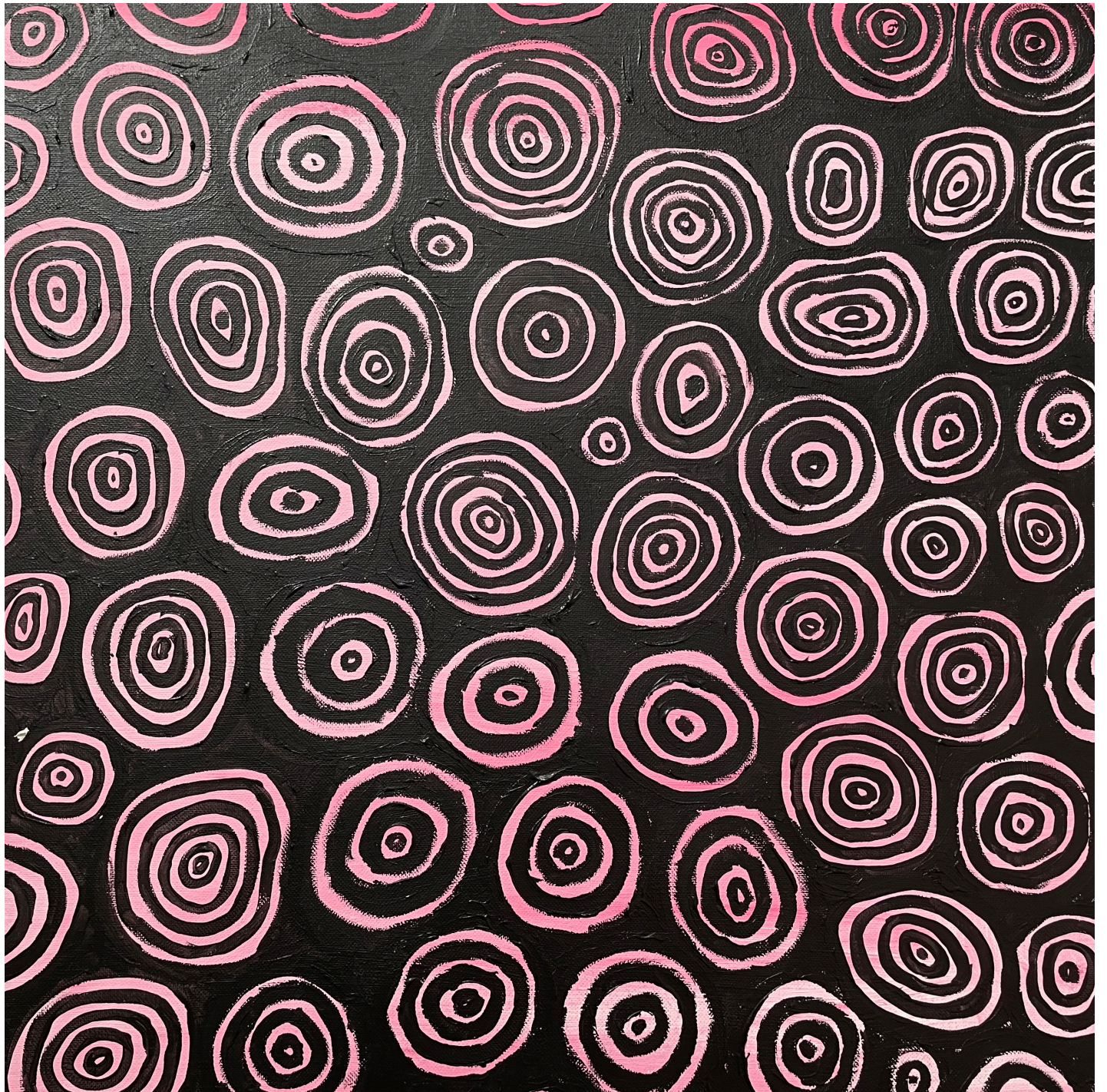
Memory Jumble, acrylic on canvas, 20x20"