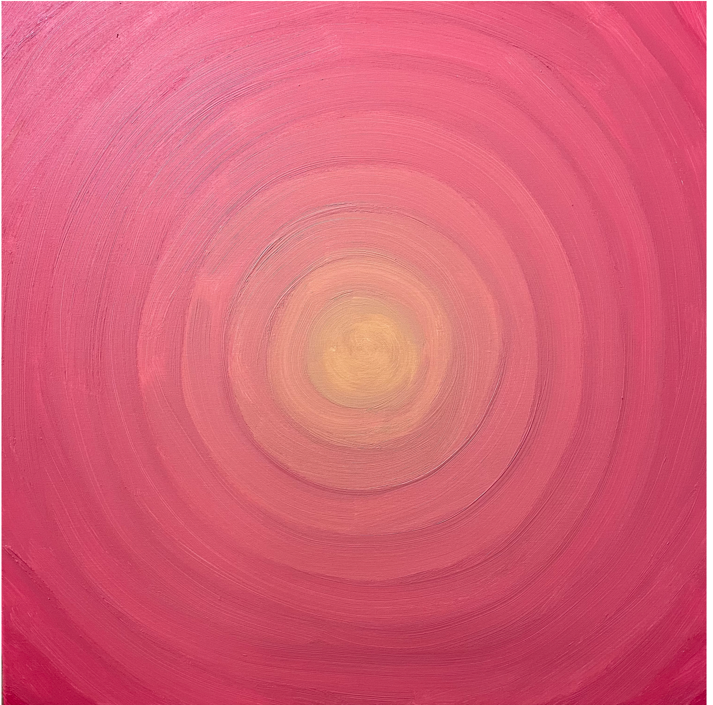
Forgotten Memory , 2022, acrylic and crackling medium on canvas, 26" x 26"