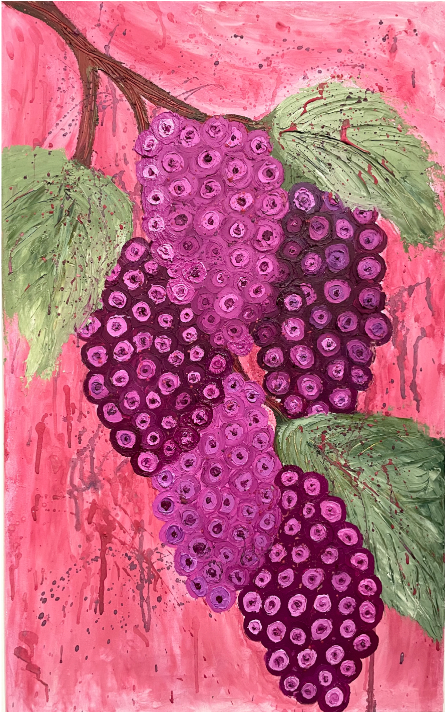
Mulberry Memories , oil paint, cold wax, and spackle on canvas, 40" x 25"