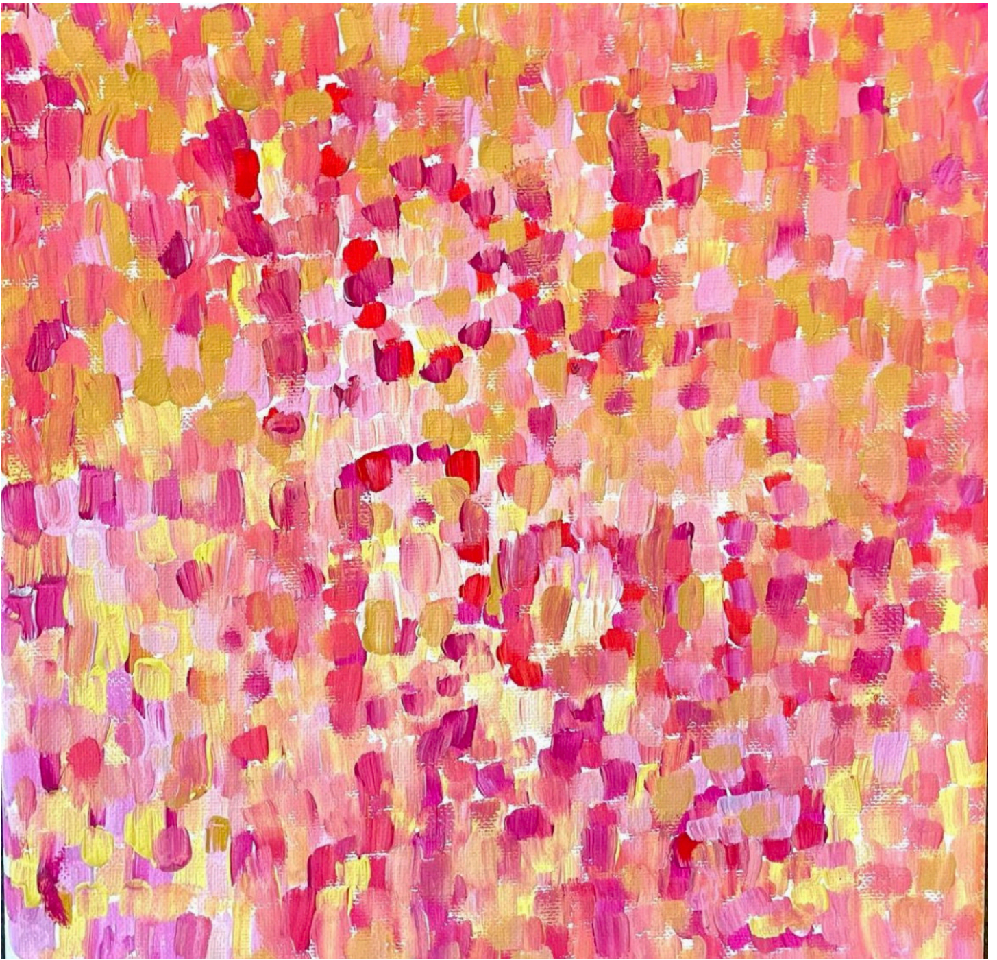
Doubt , 2022, acrylic on canvas, 10" x 10"