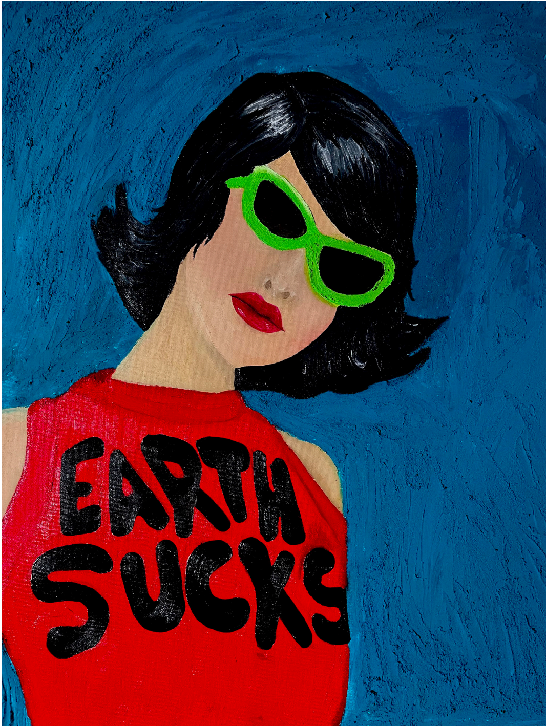
It's a Metaphor, acrylic and spackle on canvas, 20" x 16"