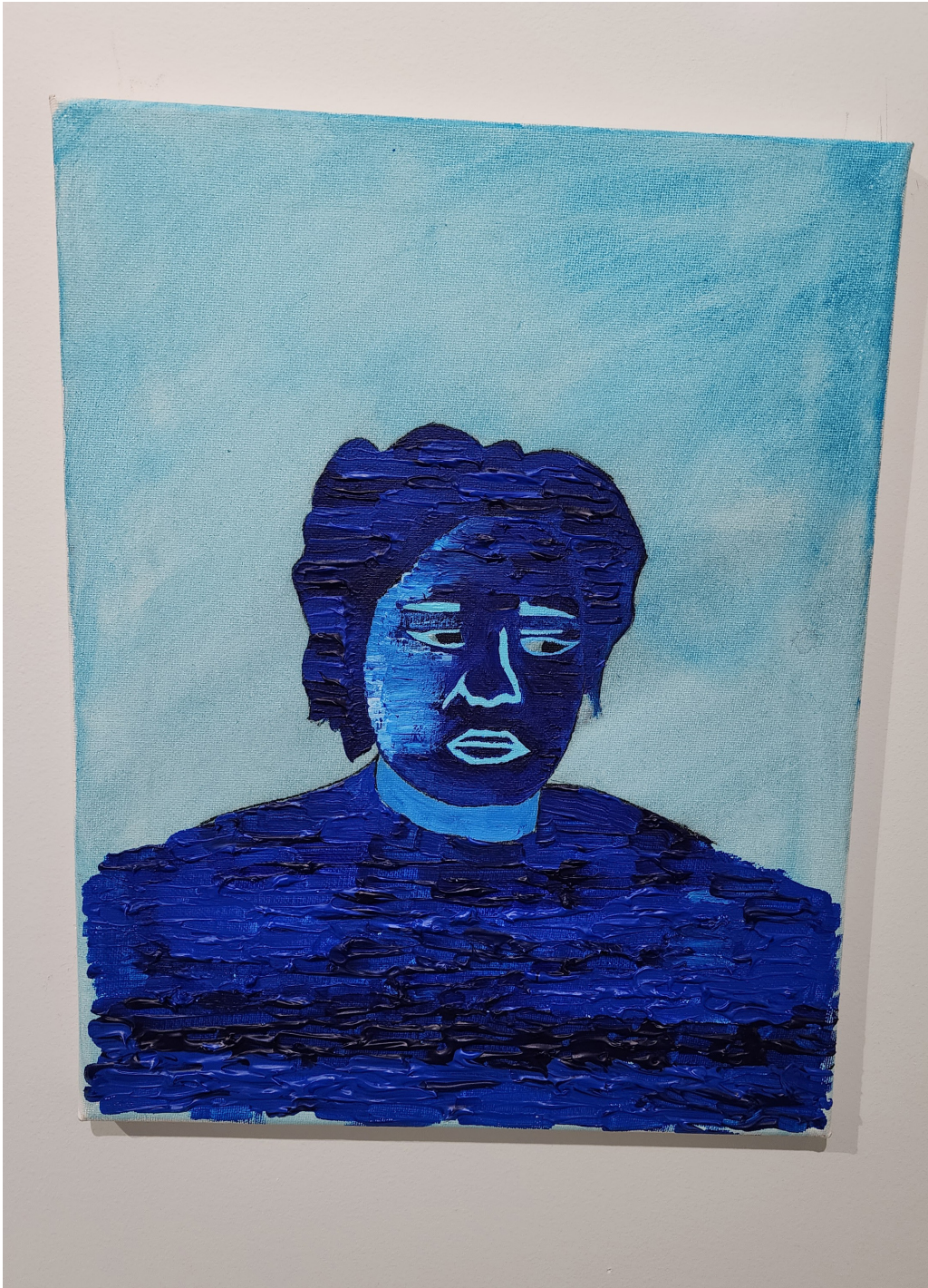
Sadness , 2023, heavy duty acrylic on canvas, 17" x 11"