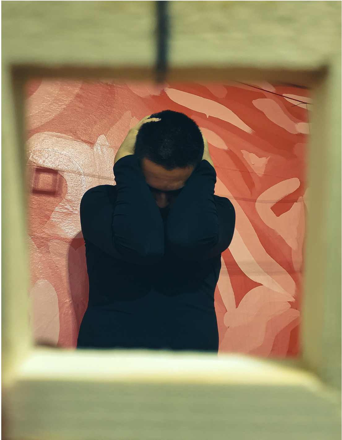
Project Identity, from photographic documentation series, #4, 2021