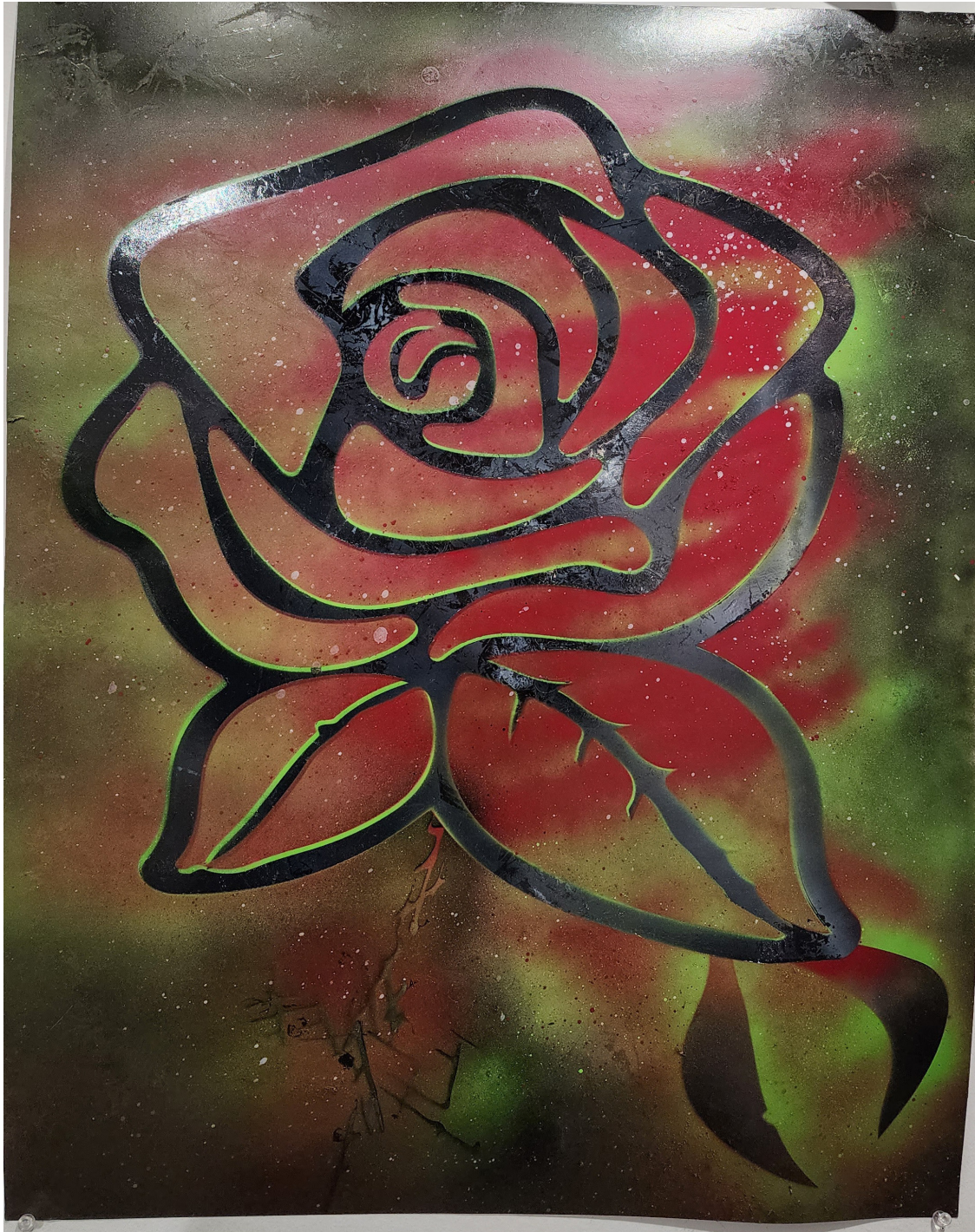
Graffiti Rose , 2023, spray paint on paper, 20" x 18"