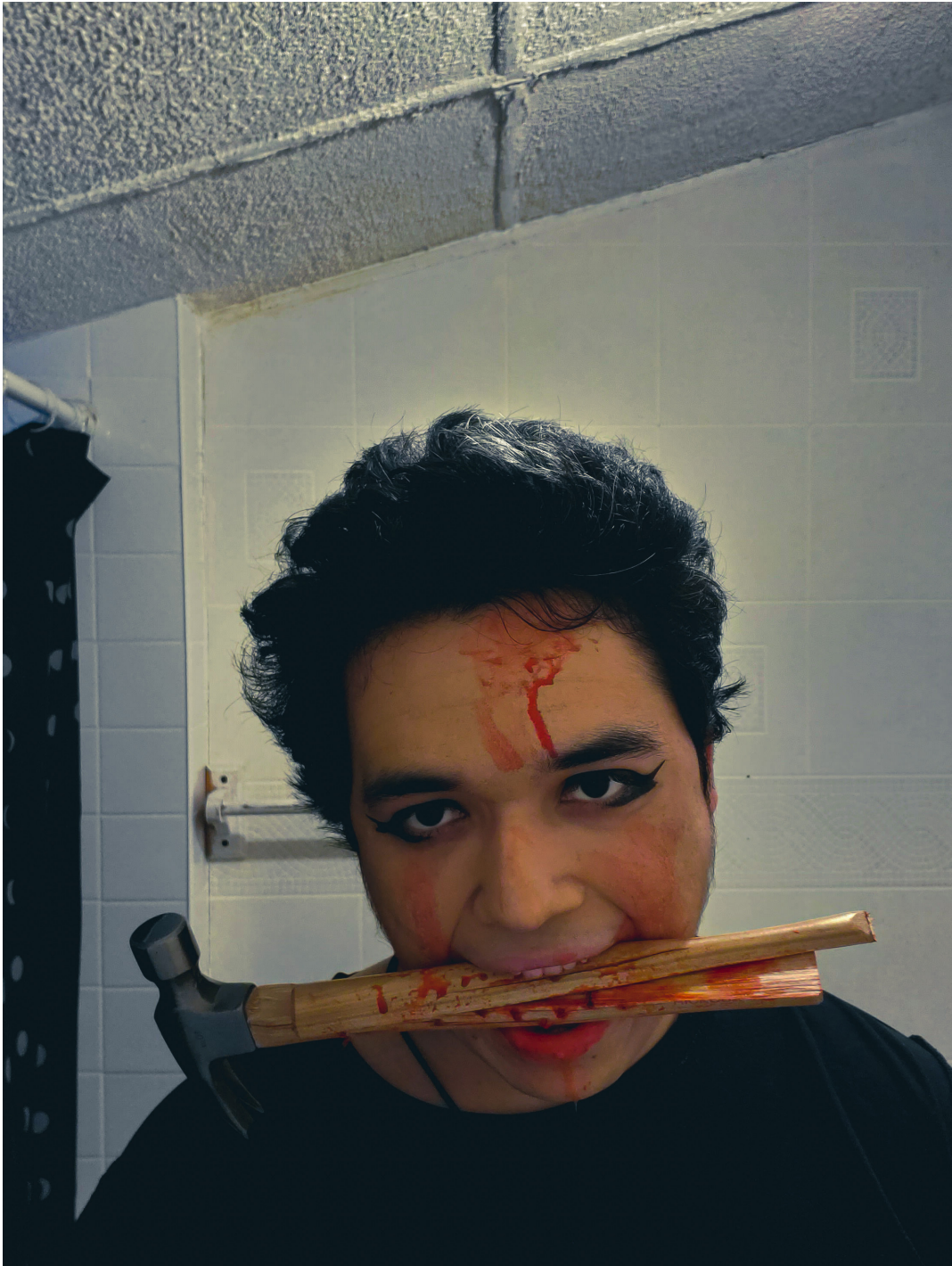
F*ck your standards, 2022, photographic documentation