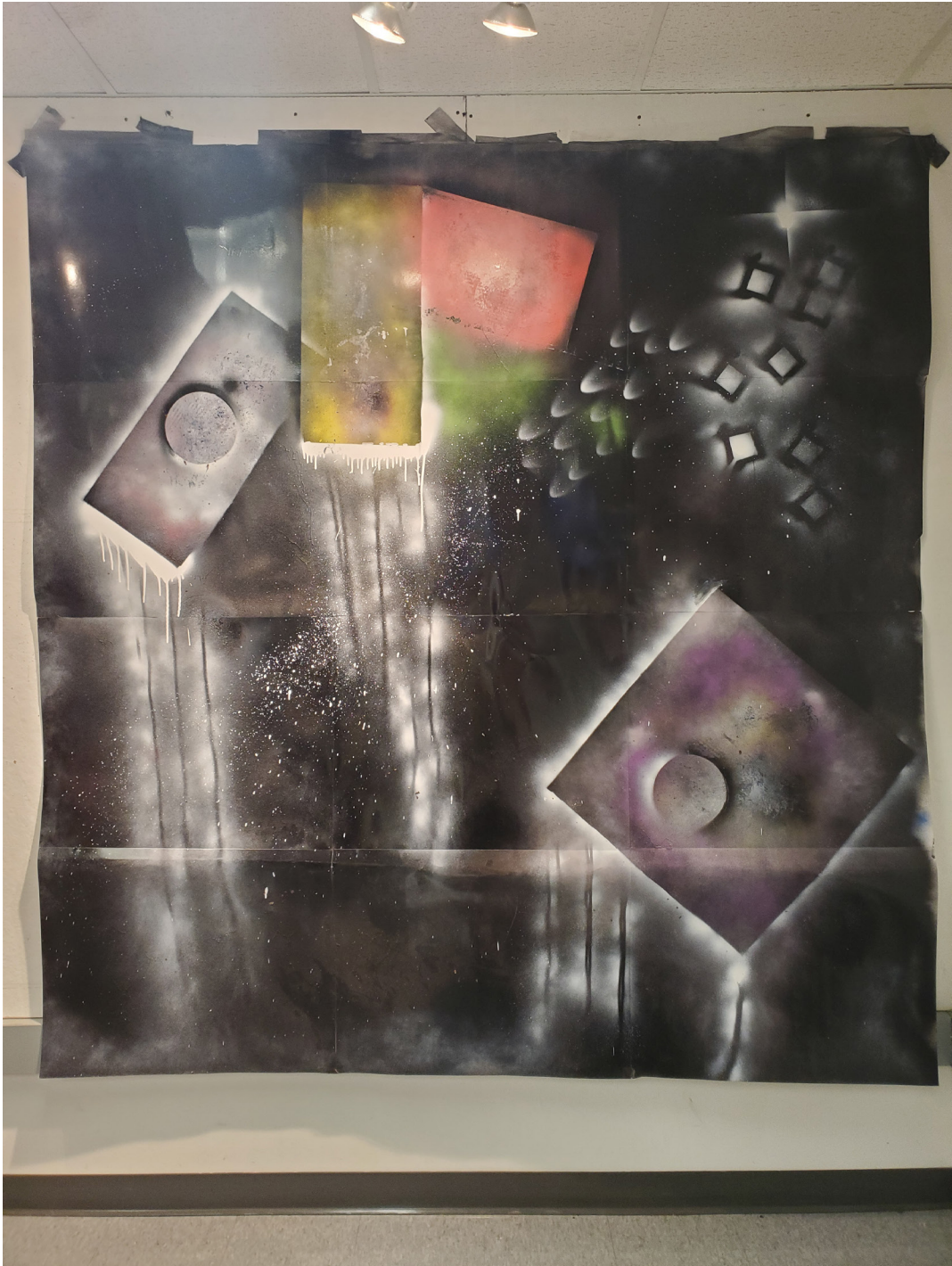
Stop She is crying , 2022, spray paint on paper, 9' x 11'