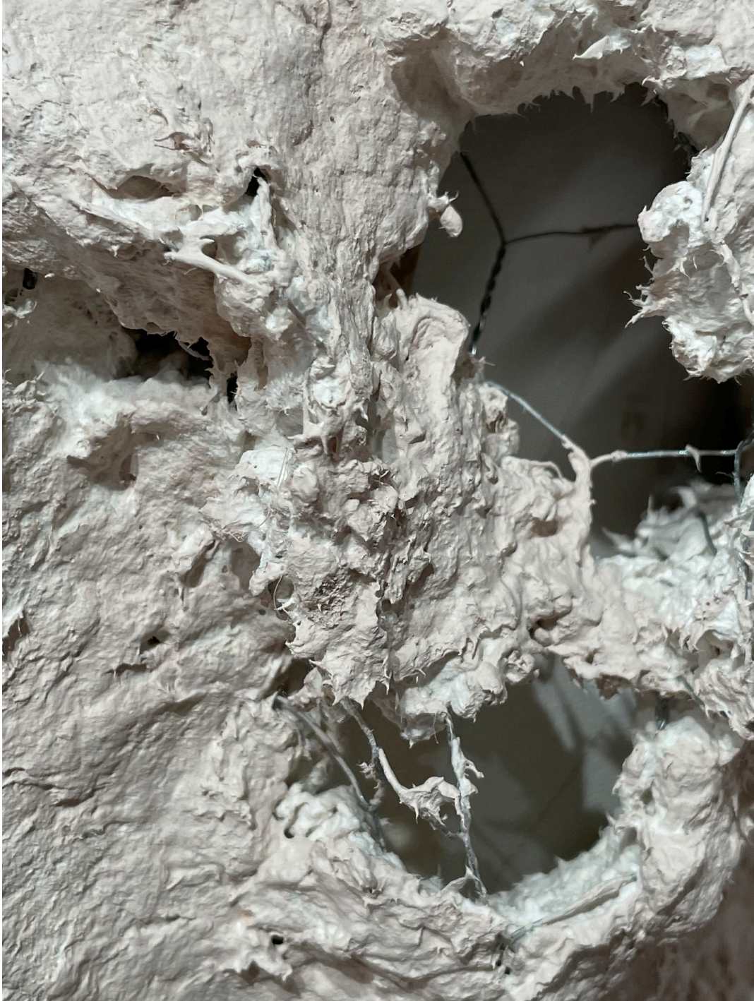
bupropion xl 300mg (Detail) , 2023, chicken wire, papier mache, acrylic, 36" x 48"