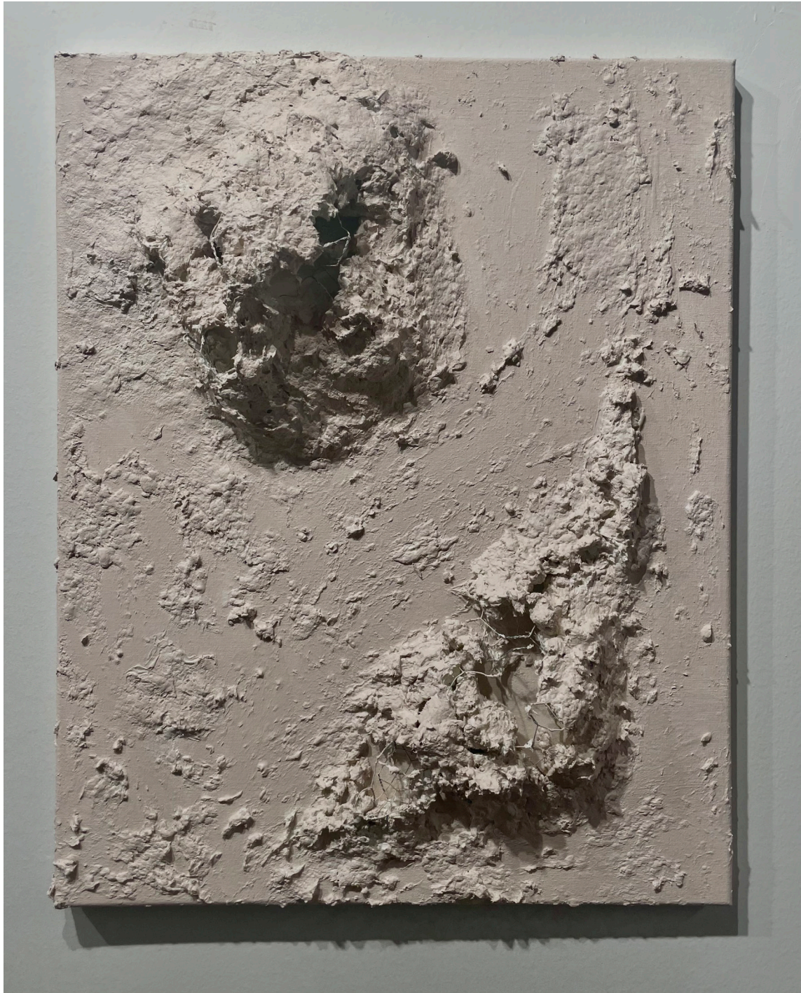
meloxicam 15mg , 2023, chicken wire, papier mache, acrylic, 24" x 18"