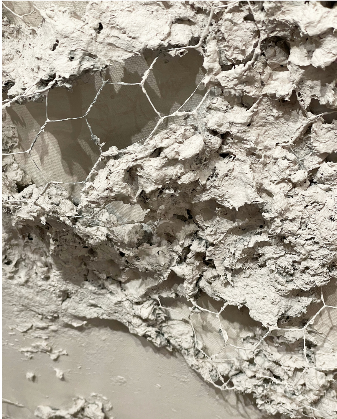
bupropion xl 300mg (Detail) , 2023, chicken wire, papier mache, acrylic, 36" x 48"