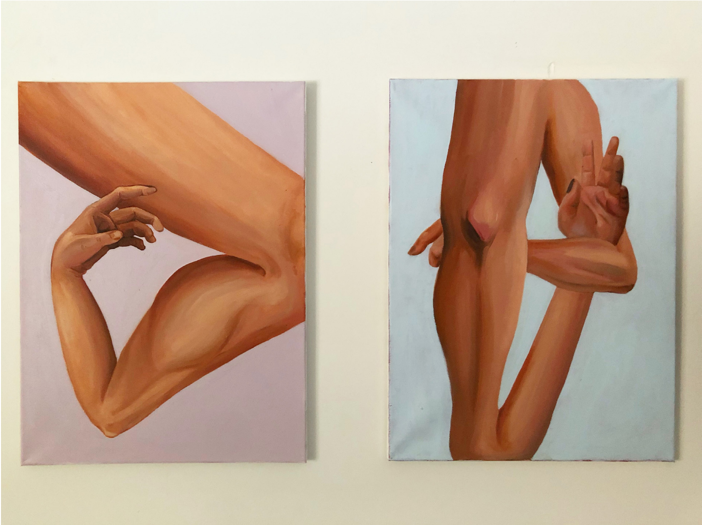
Arm and a Leg , 2018, oil on canvas, 18" x 24" each