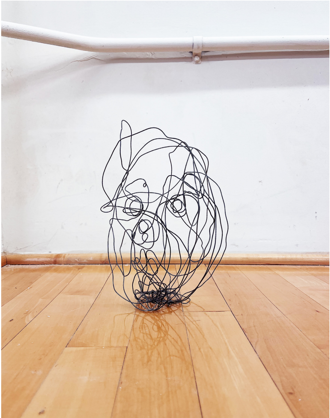
Untitled, 2022, wire, 12" x 6" x 6"