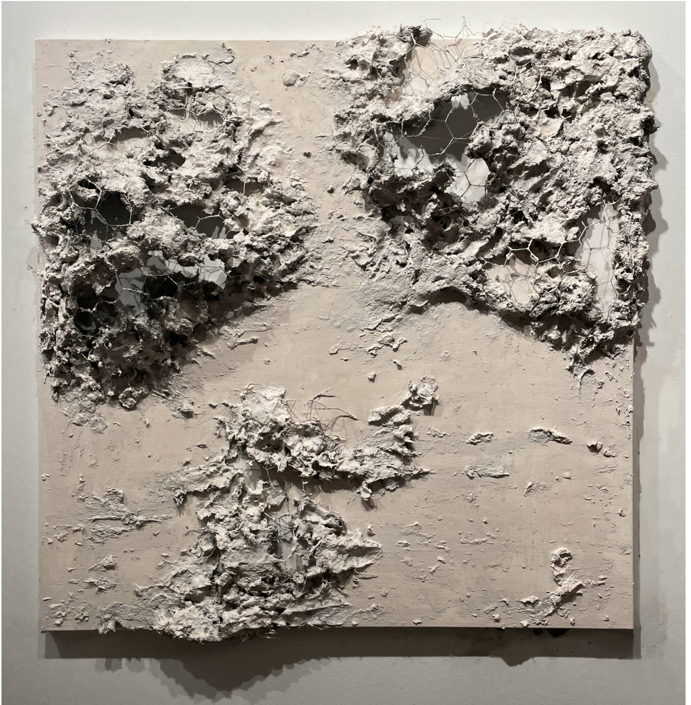
sertraline 200mg , 2023, chicken wire, papier mache, acrylic, 36" x 36"