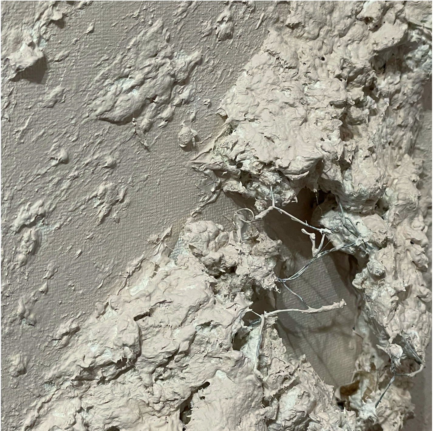
meloxicam 15mg (Detail) , 2023, chicken wire, papier mache, acrylic, 24" x 18"