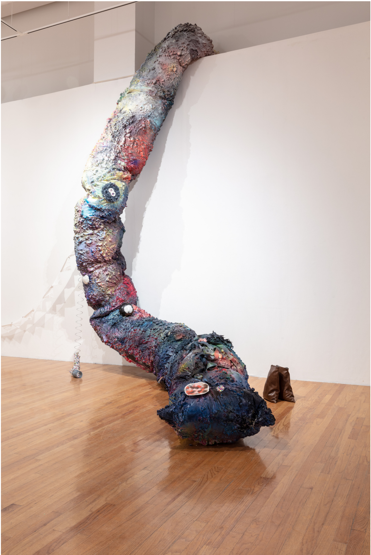
Tight Squeeze (In a Pinch) , 2021