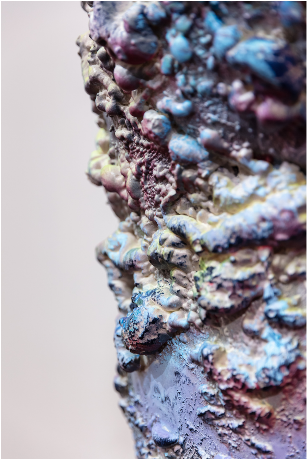
detail of Tight Squeeze (In a Pinch) , 2021