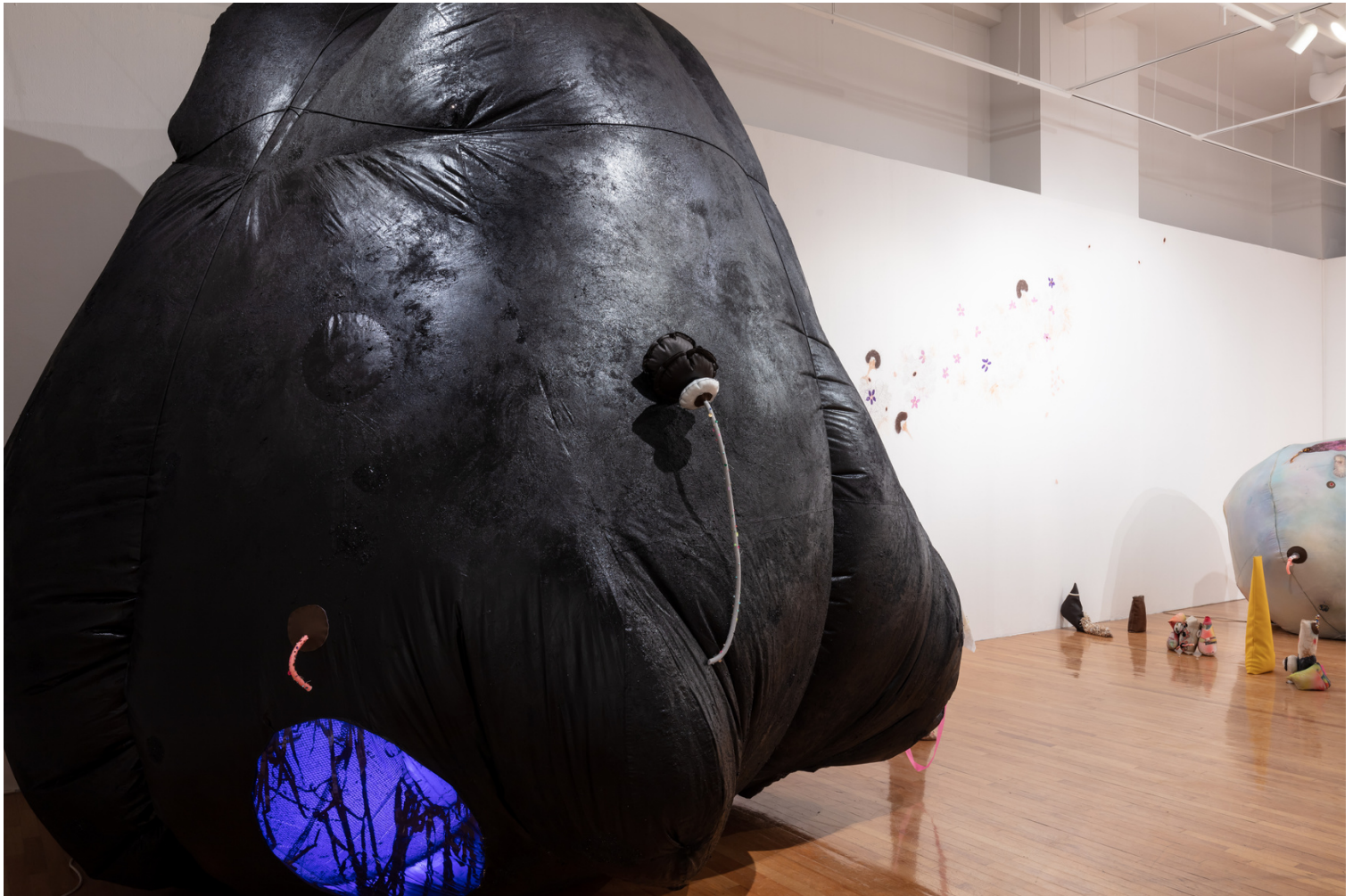
Soft Allergy installation view, Glass Curtain Gallery