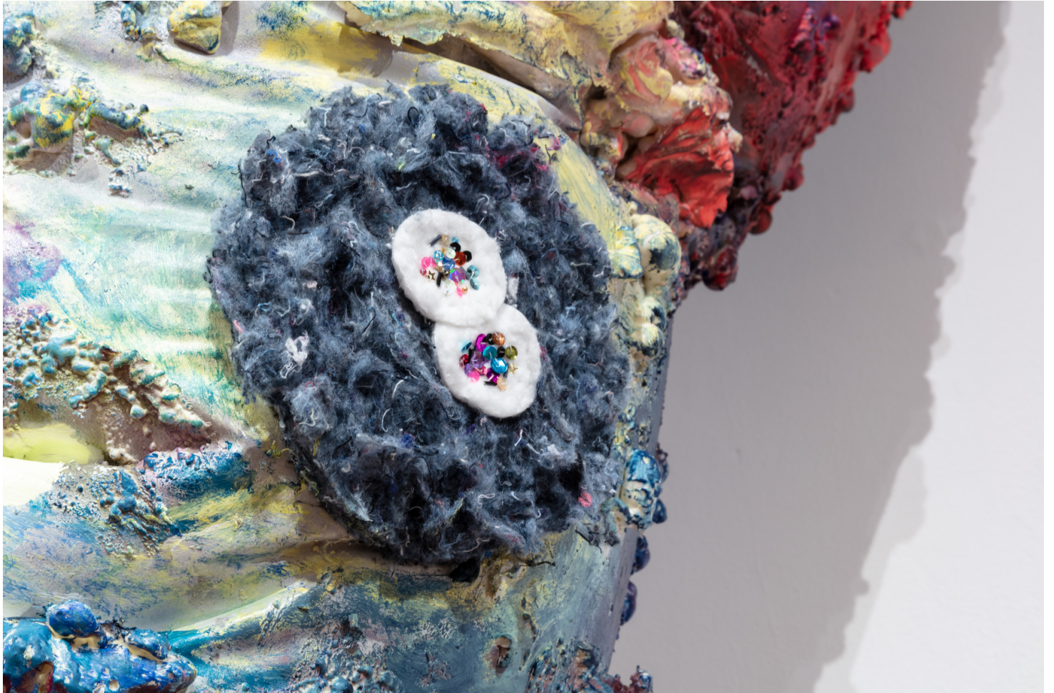
detail of Tight Squeeze (In a Pinch) , 2021