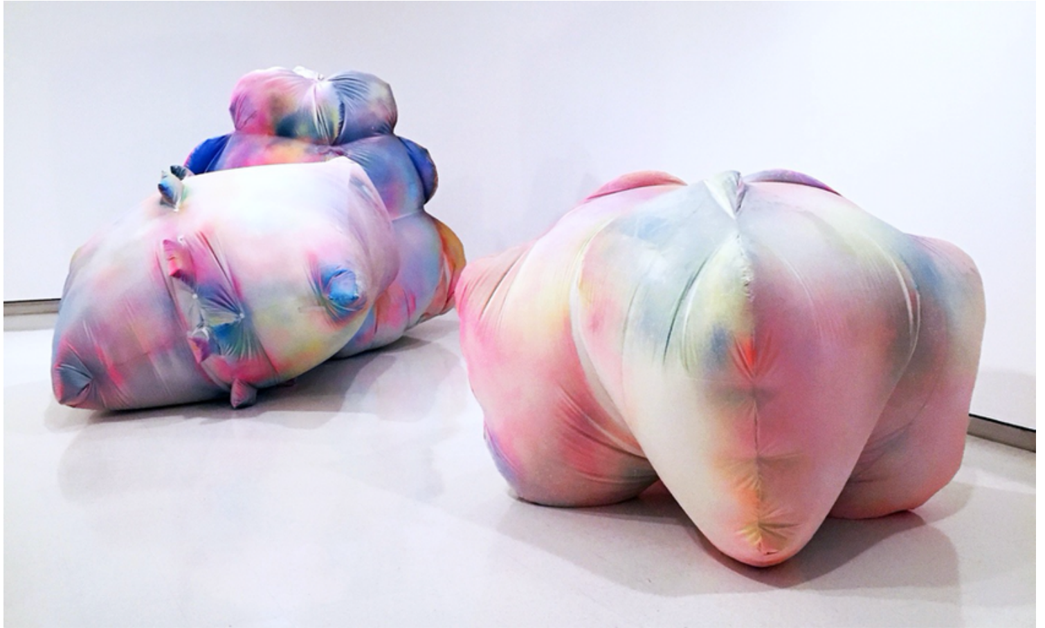
installation view of Claire Ashley: Loathsome Beauty, Loaded Body , 2017 spray paint on PVC coated canvas tarpaulin, and fans approx. 8' x 8' x 5' each