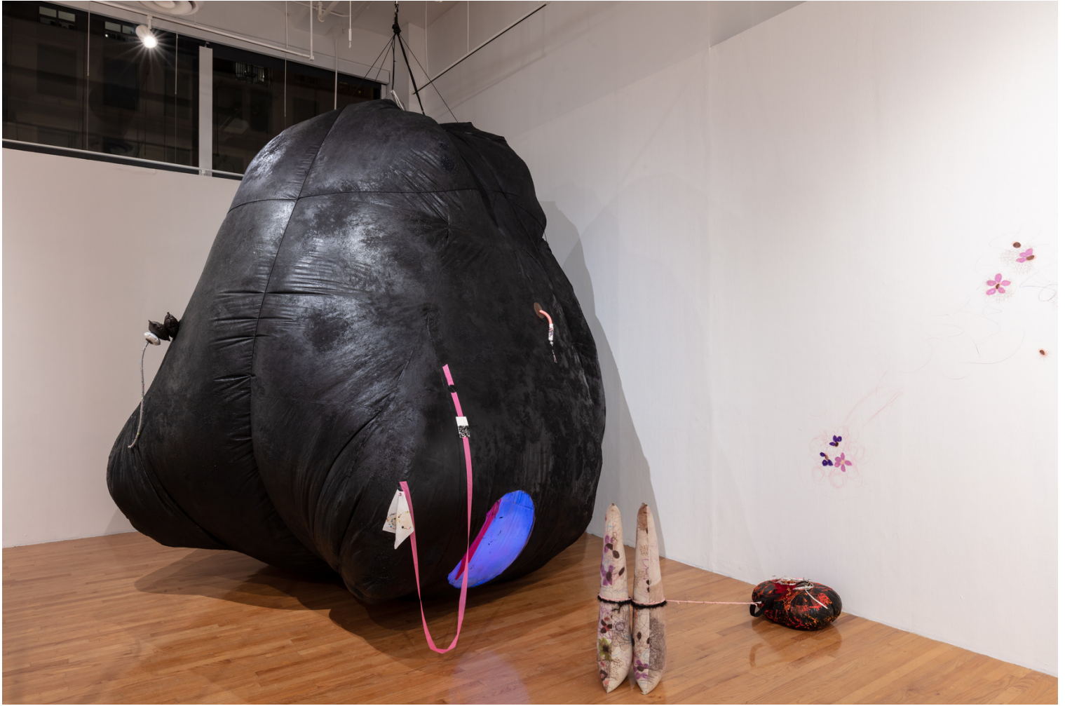
Soft Allergy installation view, Glass Curtain Gallery