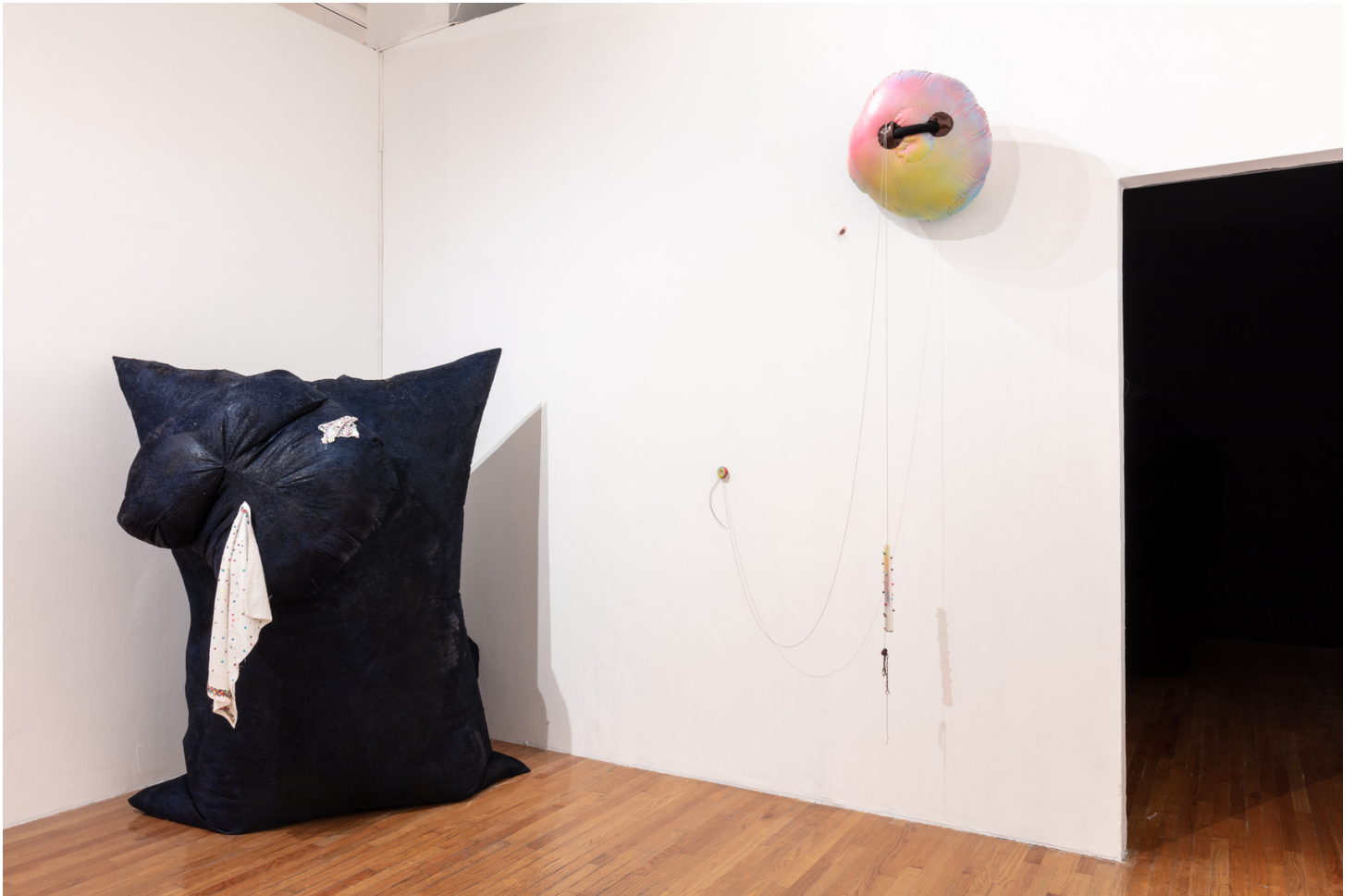
Soft Allergy installation view, Glass Curtain Gallery