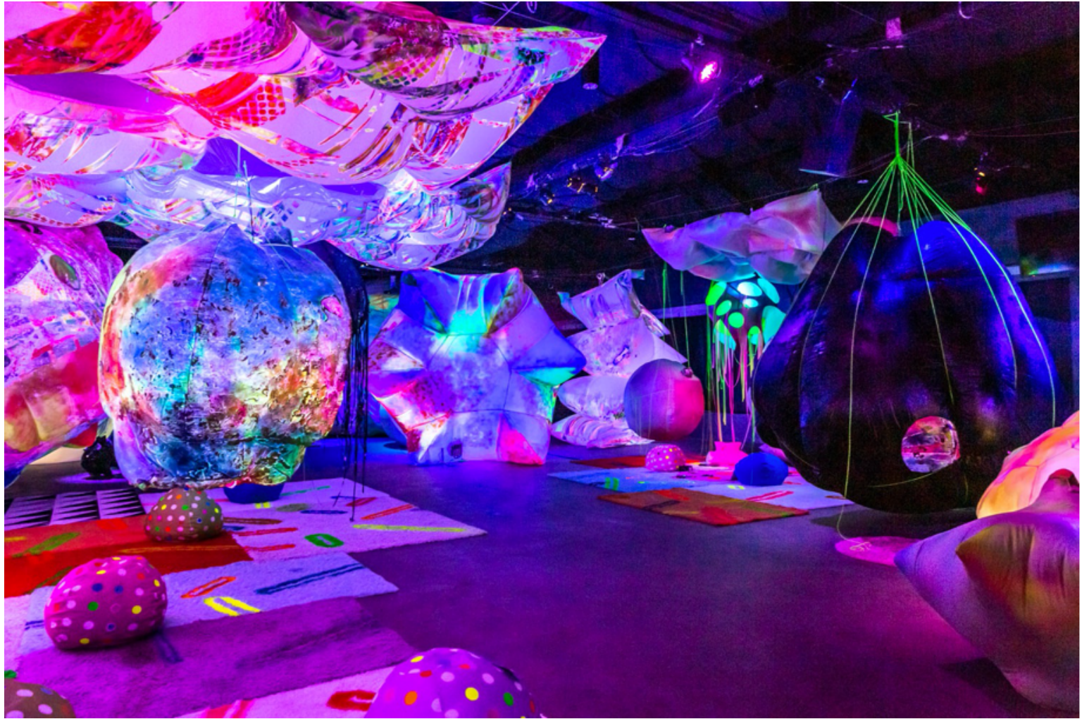
ASTROZONE: An Interactive Art Experience, 2020

spray paint, acrylic paint, sand, feathers, dirt, zippers, chain, embroidery floss, 3D prints, clear vinyl, pvc coated canvas tarpaulin, Tyvek, expandable foam, fans, and LED lights