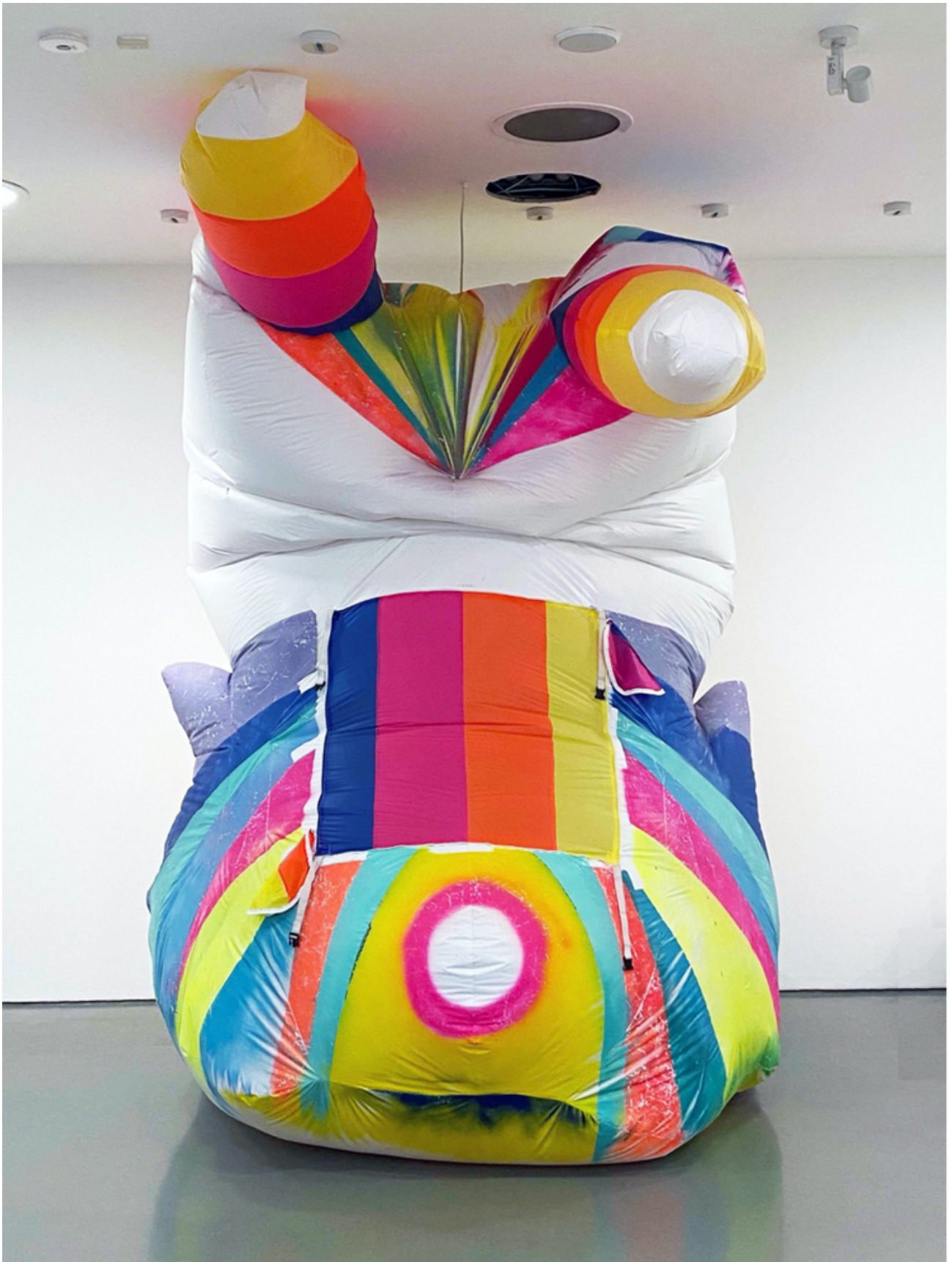
CLOWN (Laughing Stock) , 2020 spray paint on PVC coated ripstop nylon, zippers, and fan approx. 16' x 10' x 10'