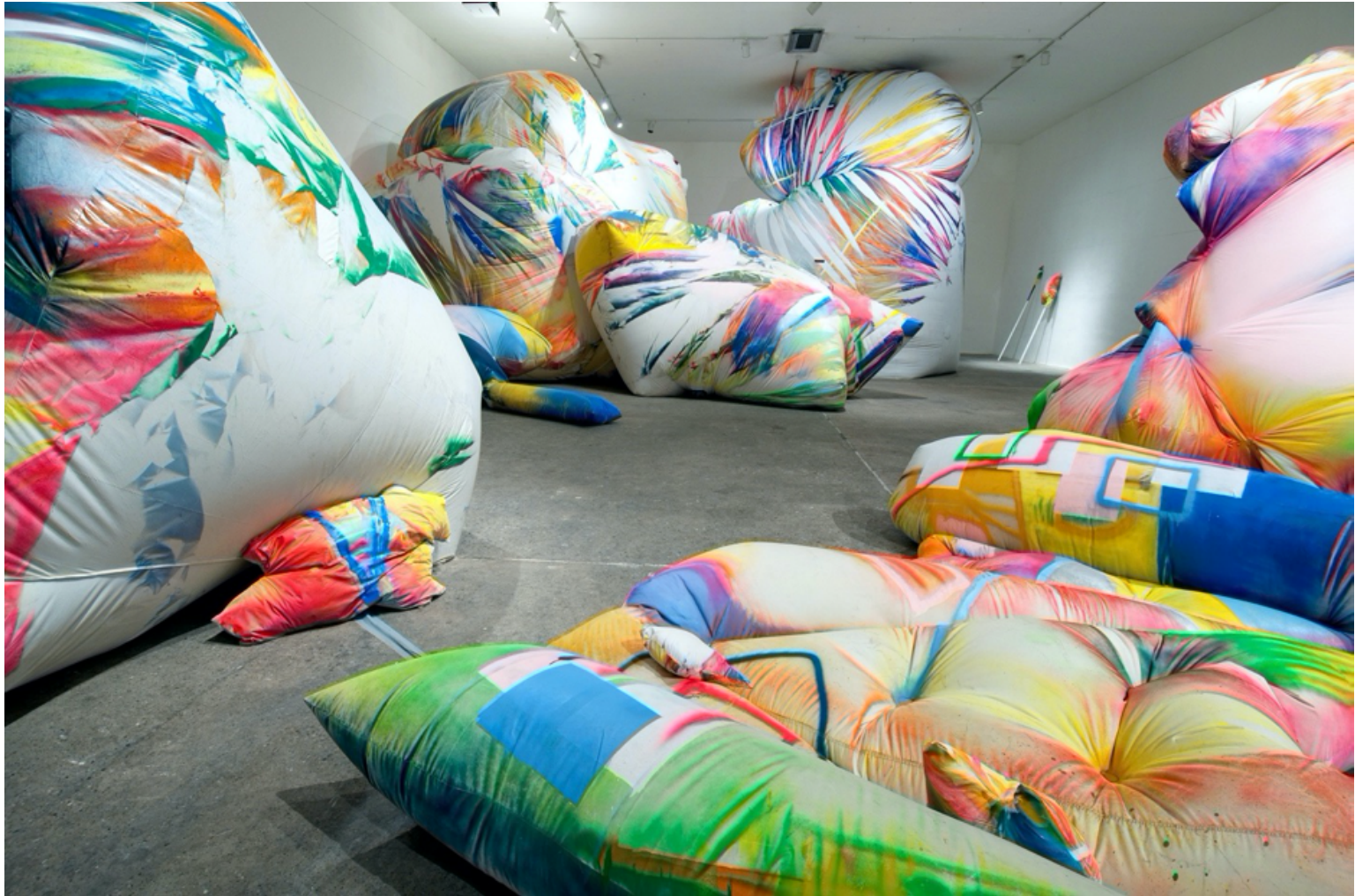
distant landscapes: peepdyedcrevicehotpinkridge, 2013 spray paint on PVC coated canvas tarpaulin and fans