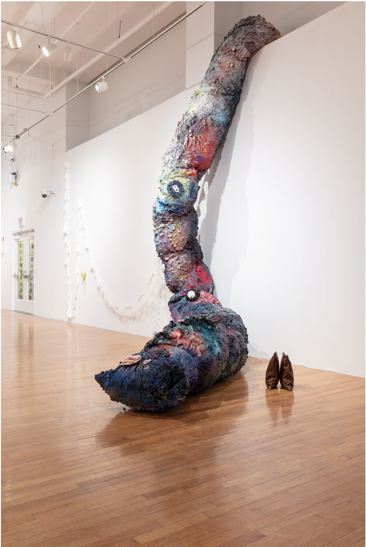
Tight Squeeze (In a Pinch) , 2021