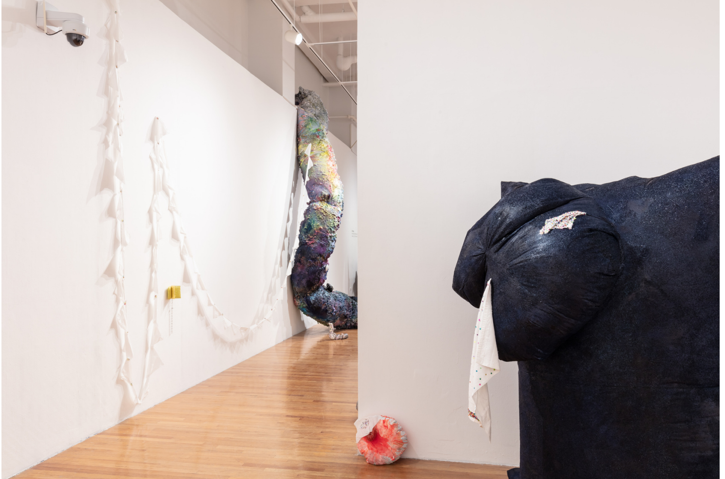
Soft Allergy installation view, Glass Curtain Gallery