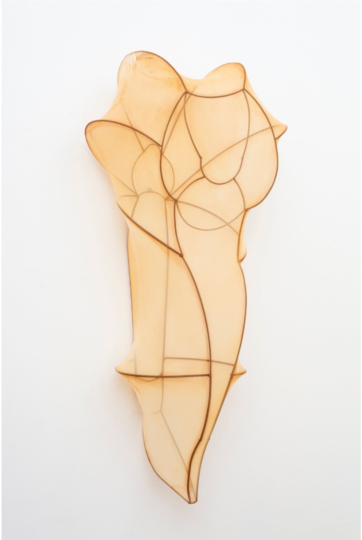
Encyclia Imagosis #6 , 2020, metal and oxidized fabric