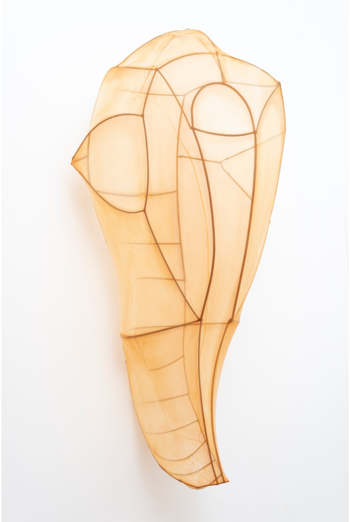
Encyelia Imago #8 , 2020, metal and oxidized fabric