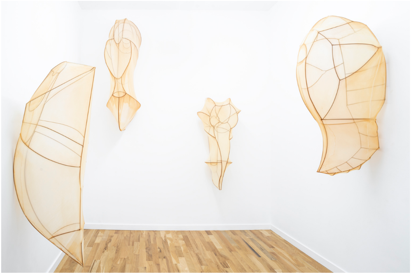
Encyclia Imagosis , 2020, metal and oxidized fabric