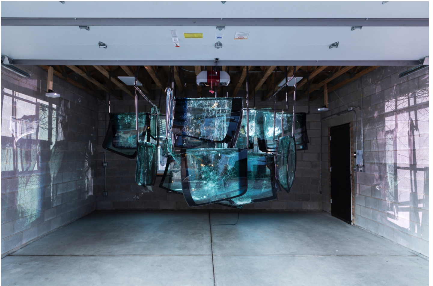
Collabiosis , 2020, windshields, steel, projection